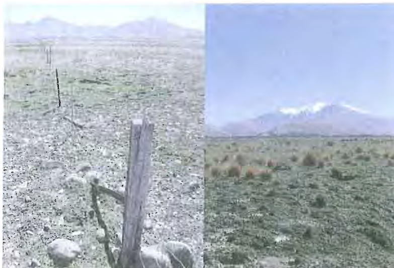
Looking up an existing old fence line, planned for use as eastern boundary for planned CA2 in the preliminary proposal; with an area of Sawdon outwash to be made freehold.

The resulting ecological corridor produced from linking CA1 with CA2 may form the last chance to link significant altitudinal sequences in the Eastern Mackenzie basin with the area's intriguing climatic and Significant Inherent Values (SIVs). It has also been identified as having areas of High Visual Vulnerability, which indicates that very little change could occur without changing the qualities of the landscape and being highly noticeable (Conservation Resource Report (CRR)). This occurs on Corner Hill, north of Dog Kennel Corner, where a striking transition from the cooler, moister east faces abruptly gives way to drier west faces. From the alpine mountain tops of the Two Thumb Range down to the basin's Sawdon outwash is a continuous uncultivated corridor, containing very important habitat for the likes of rare skinks and 3 threatened birds. While we were inspecting the property banded dotterels were found, possibly nesting on the Sawdon outwash.