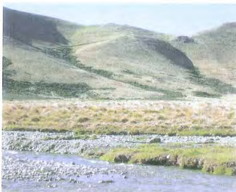
View across Sawdon Stream to a "chronically threatened" area of Carex at the bottom of Mt Maude valley. This area is currently planned for disposal as freehold land without any protective mechanisms.

The entire Middle Sawdon flats and the Corner hill are classed as "at risk" land environments by LENZ, with the adjoining scrub and wetland on Sawdon Stream floodplain upstream of SH8 categorised as either "acutely" or "chronically" threatened, see Proposed Designations Map. The Upper Sawdon stream is a very important habitat for indigenous freshwater fish.