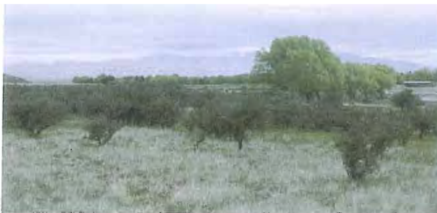
Matagouri growing on the banks of the Sawdon Stream in an "acutely threatened" environment. This land is also planned to be disposed as freehold over which there will be no protective mechanisms.

While our proposed changes could mean a requirement for approximately 2,300 metres of new fencing, this is approximately 2,600 metres less than the 4,900 metres that may be required for the proposed "R-S" and "T-U" fence lines in the Preliminary Proposal.