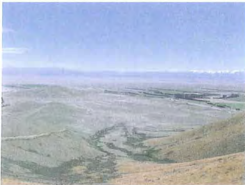
View of the Middle Sawdon flats extending down to the Sawdon outwash and Edward Stream floodplain just beyond the boundary of Holbrook Station

The surroundings of middle flats, hills, the Sawdon Stream floodplain and lower Mt Maude valley hill slopes all help to form a very impressive cultural landscape. It sets an appropriate immediate broader setting for the memorials commemorating the history of the larger basin, and especially for that of the Dog Kennel Corner memorial area. Here you truly know that you have arrived in the dry almost desert like Mackenzie Basin with an outstanding view of the Southern Alps, worth keeping "for all the world" to see.