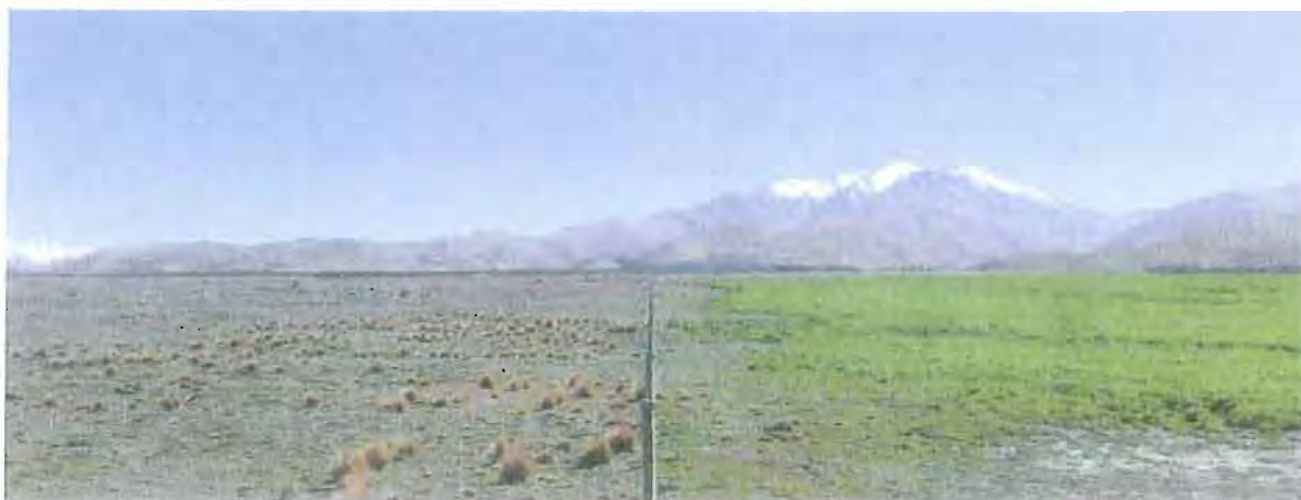
A view looking north along the fence line between a southern cultivated paddock and the remaining Sterickers Mound Pukaki RAP 18 on Sawdon Stream floodplain, all to be made freehold.