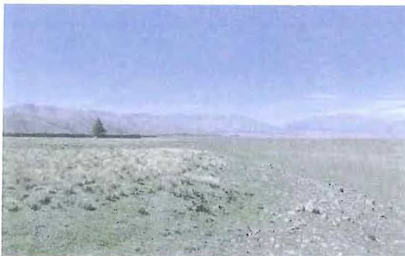
Short tussock of Holbrook terrace, above the stark beauty of the uncultivated Sawdon outwash proposed for freehold, habitat for endemic species of this area including a ground burrowing weta (Hemiandrus sp.)

Once again, we thank you for giving us the opportunity to make a submission on this proposal.