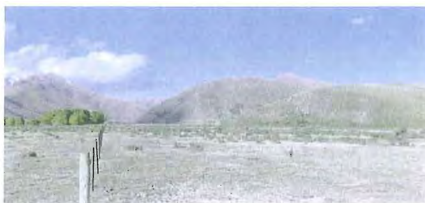
Looking up the continuous natural corridor between the Sawdon Stream and Sterickers Mound.

The resulting ecological corridor produced from linking CA1 with CA2 may form the last chance to link significant altitudinal sequences in the Eastern Mackenzie basin with the area's intriguing climatic and Significant Inherent Values (SIVs). It has also been identified as having areas of High Visual Vulnerability, which indicates that very little change could occur without changing the qualities of the landscape and being highly noticeable (Conservation Resource Report (CRR)). This occurs on Corner Hill, north of Dog Kennel Corner, where a striking transition from the cooler, moister east faces abruptly gives way to drier west faces. From the alpine mountain tops of the Two Thumb Range down to the basin's Sawdon outwash is a continuous uncultivated corridor, containing very important habitat for the likes of rare skinks and 3 threatened birds. While we were inspecting the property banded dotterels were found, possibly nesting on the Sawdon outwash.