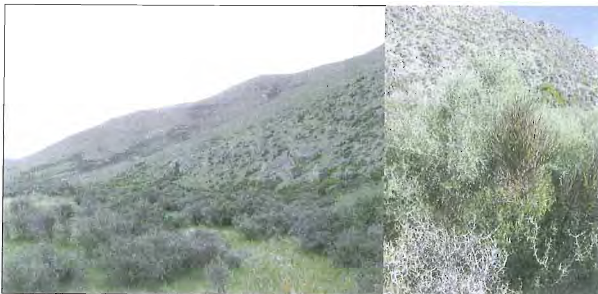
Distinctive native grey scrub of matagouri, coprosma and olearia, including prostrate kowhai and native broom species in a "chronically threatened" environment in Mt Maude valley, we propose be added to CA1.

While our proposed changes could mean a requirement for approximately 2,300 metres of new fencing, this is approximately 2,600 metres less than the 4,900 metres that may be required for the proposed "R-S" and "T-U" fence lines in the Preliminary Proposal.