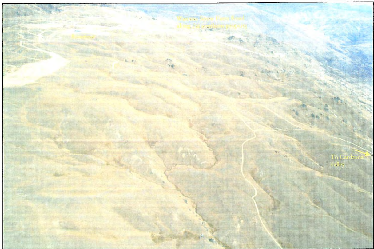
Photo 18: The upper portion of the property that adjoins Waiorau Snow Farm is dominated by alpine fescue tussockland, with seeps in the gullies, and cushionfield on exposed ridge tops. The recently developed reservoir containing water can be seen at the property boundary. The farm track crossing the property lower down provides opportunities for mountain biking and horse trekking from the Cardrona Valley to the Mt Pisa part of Pisa CA.