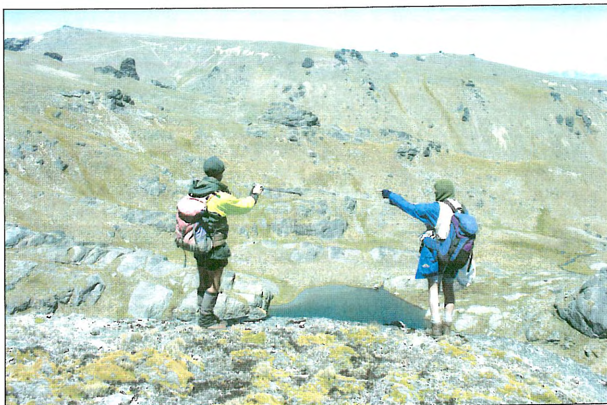
Photo 14: Cliff Burn headwaters and glacial tarn. Dracophyllum muscoides dominated cushionfield occupies the soil hummocks and solifluction lobes on the exposed ridge. In the background, a section of the 4WD track can be seen, which passes under Mt Pisa is located on Robrosa Pastoral Lease, and is used by a range or recreationists.