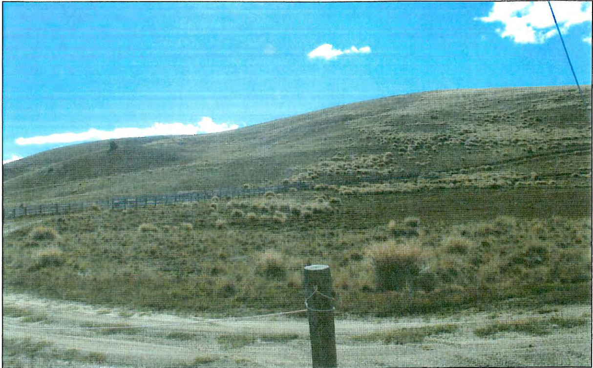
Photo 19: The fence line running up the centre of the hill demarcates the property boundary between Robrosa PL (left hand side) and Pisa Conservation Area (right hand side). The Pisa Range summit track can be seen here on the Pisa CA.