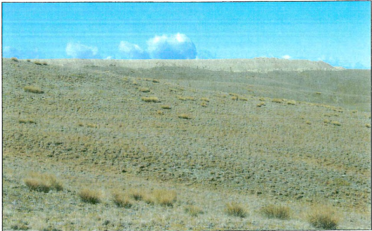
Photo 17: A large reservoir for snow making purposes has recently been excavated on the property (with no consent under the CPLA), adjacent to the car tyre testing activities at Waiorau Snow Farm.