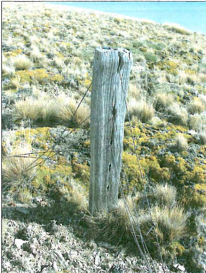
Photo 20: Several old totara posts with wires running through holes are present on the Lease. These represent physical evidence of the pastoral history of the property.