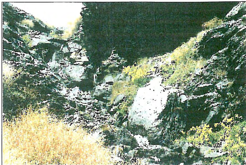
Photo 15: An incised stream in the upper Luggate catchment. Yellow snow marguerites ( Dolichoglottis hyalii ) cling to the damp sides.