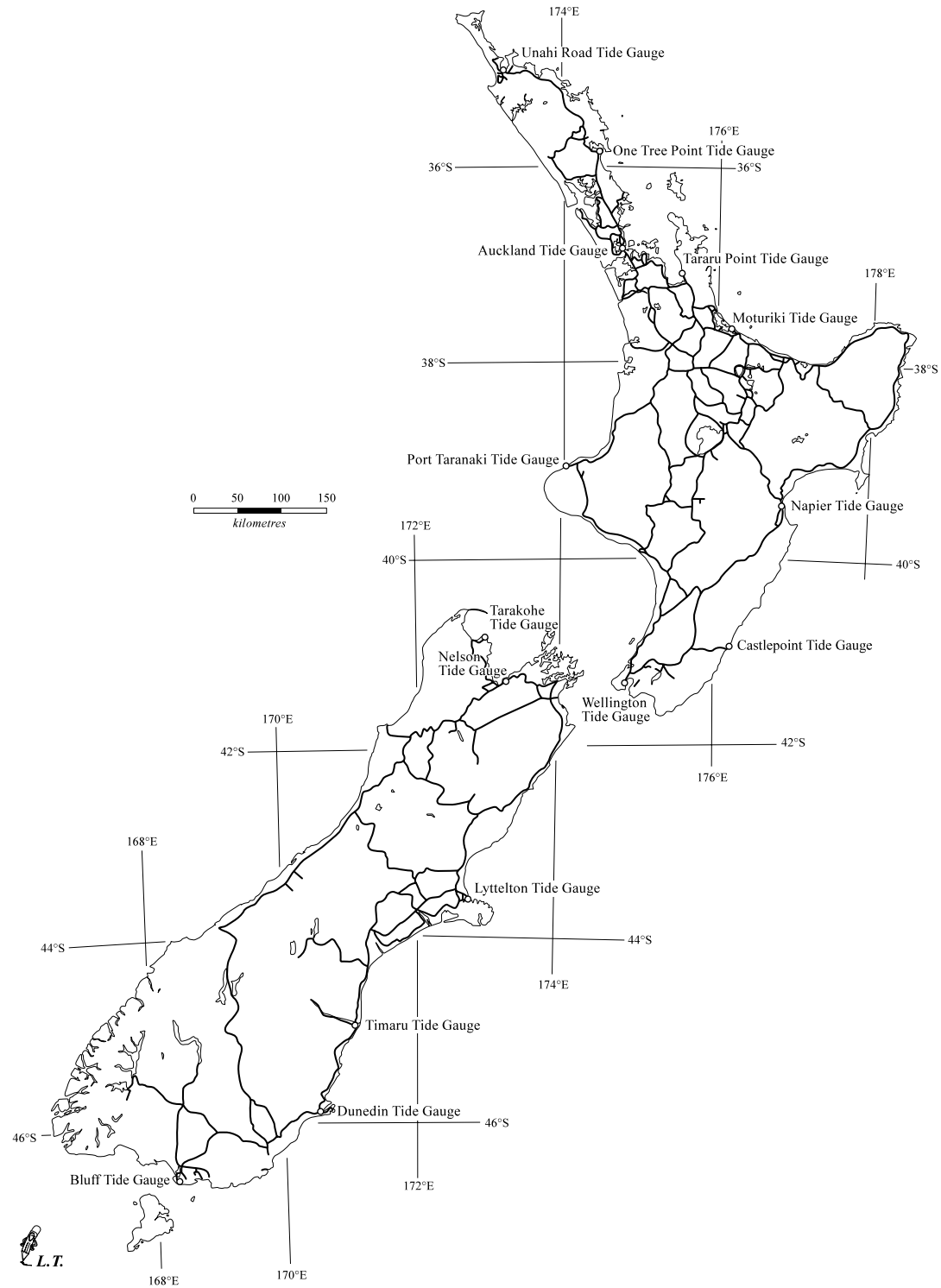
Figure 1 - New Zealand Precise levelling network and associated tide gauges as at 1990 (adapted from NZNCGG, 1991). Note the Gisborne tide gauge is located north of Napier at the 178 Longitude.