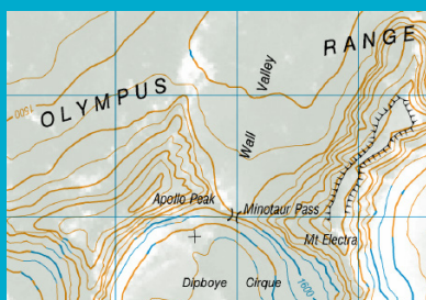
Minotaur Pass, Olympus Range