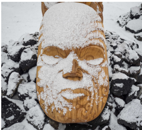
Pouwhenua at Scott Base (NZ)

We provide authoritative information on our place names online through the New Zealand Gazetteer . We also contribute our official names to the international SCAR Composite Gazetteer of Antarctica , ensuring they are known by other nations operating in the region.