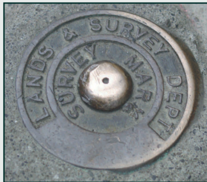
An example of one of the many types of survey marks.

organisation under Section 55 of the Cadastral Survey Act 2002. A Licensed Cadastral Surveyor must oversee the reinstatement or replacement to the standards set by the Surveyor-General.