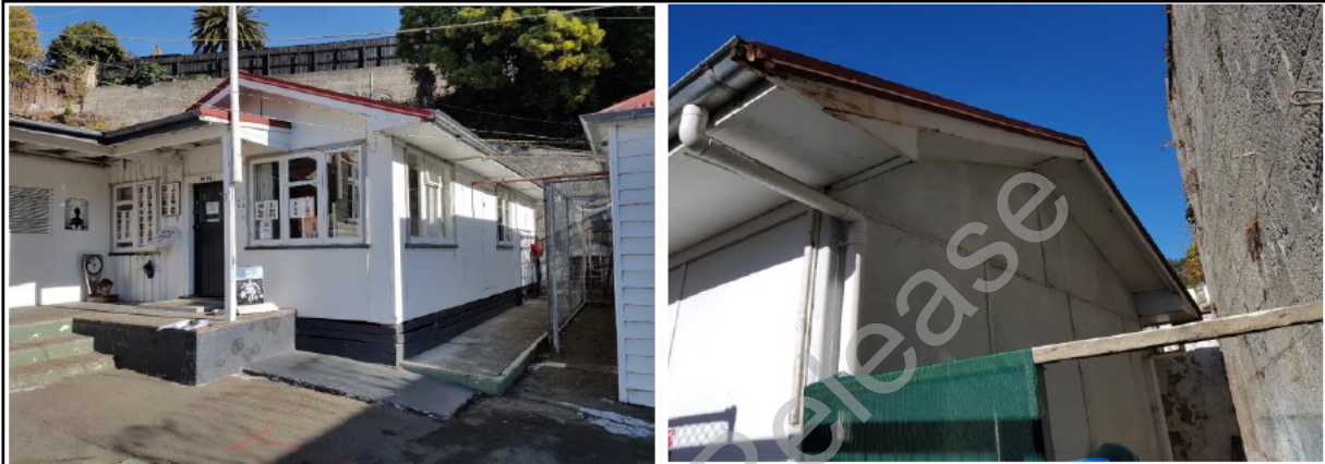
NOTE: THERE ARE MORE PHOTOS ON PAGE 1a ATTACHED