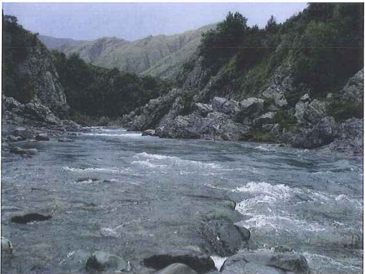
Wild , beautiful gorge