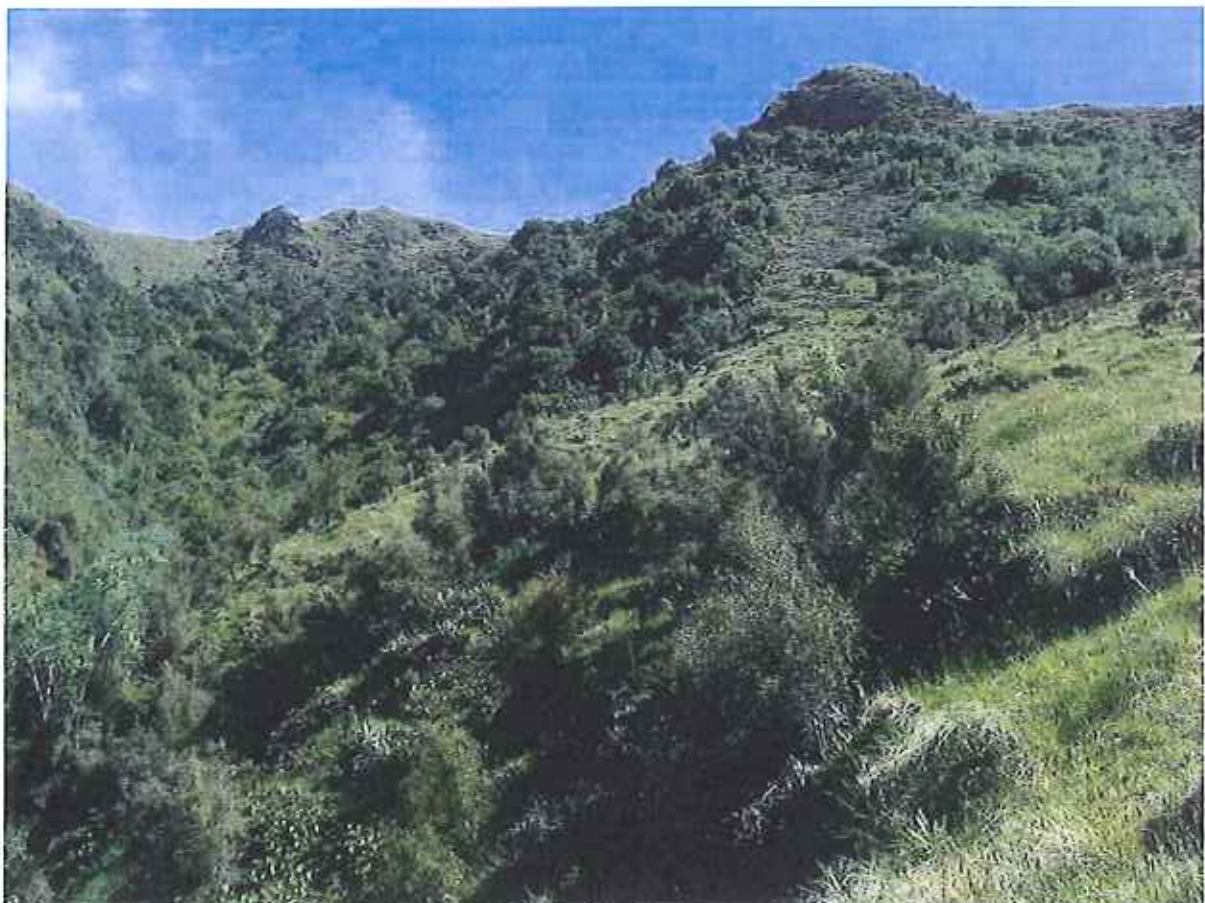
Middle valley with extensive native bush area and shrublands