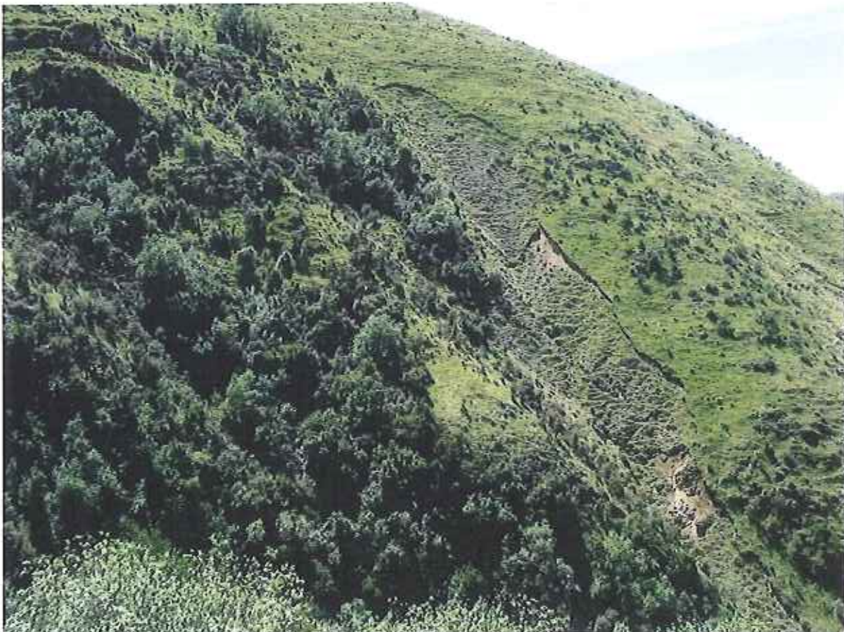
Middle valley: again note the native shrublands and the slip