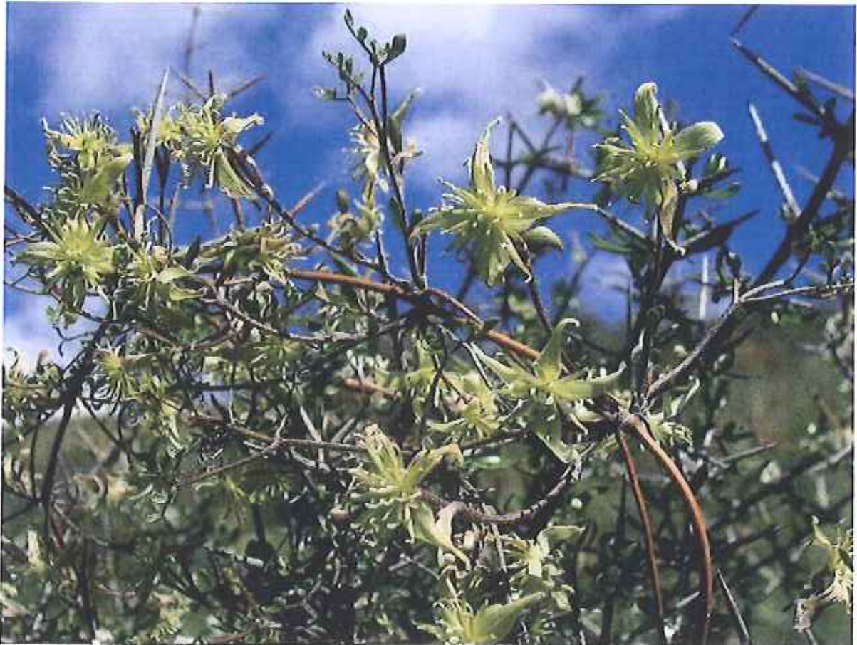
Yellow clematis Clematis marata : this species is not mentioned in the Conservation Reports