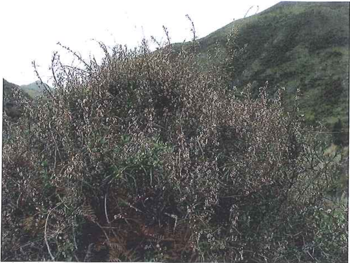
Native jasmine Parsonia capsularis