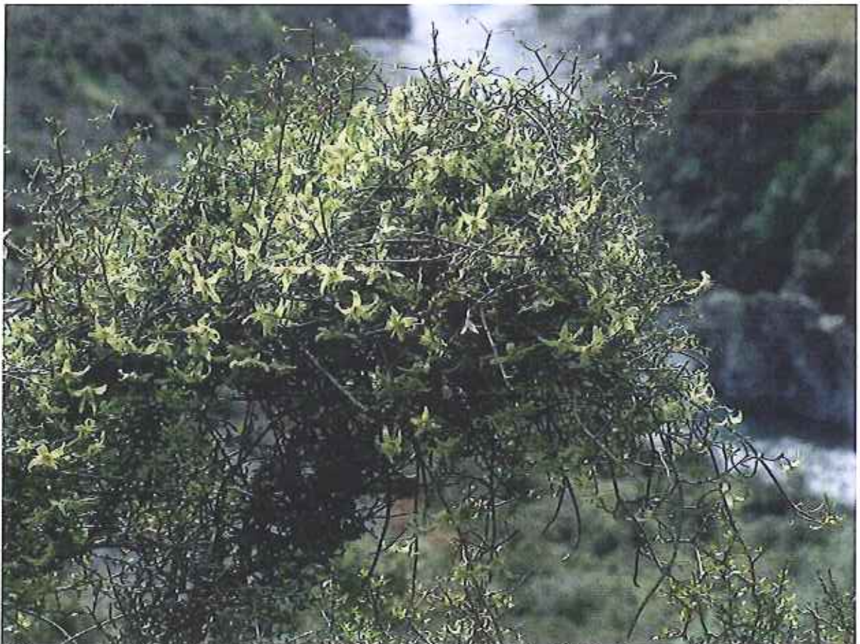
Yellow clematis Clematis marata : again the species is not mentioned in CRR, but has good numbers here as well