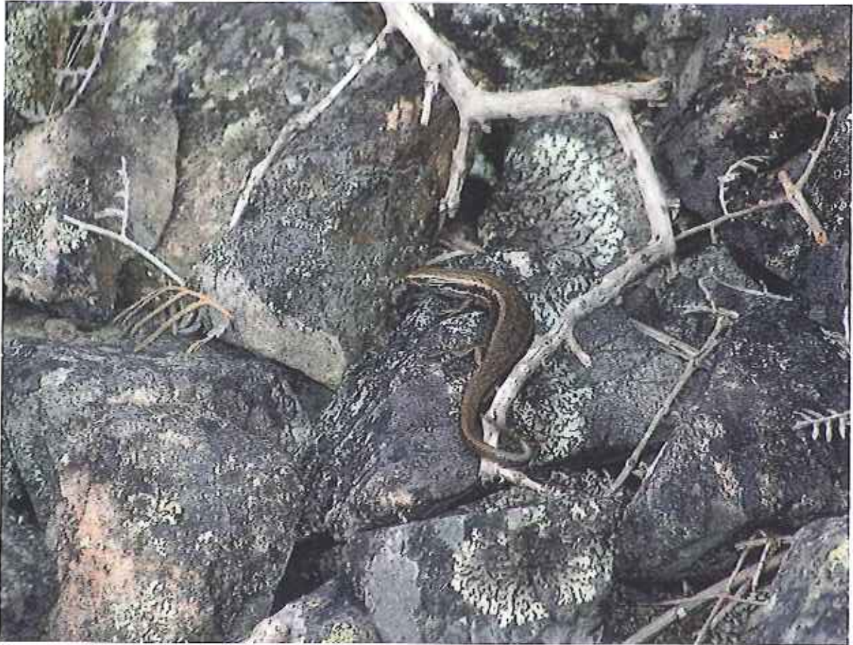
Common skink Oligosoma polychroma : observed in a number of locations on river terrace