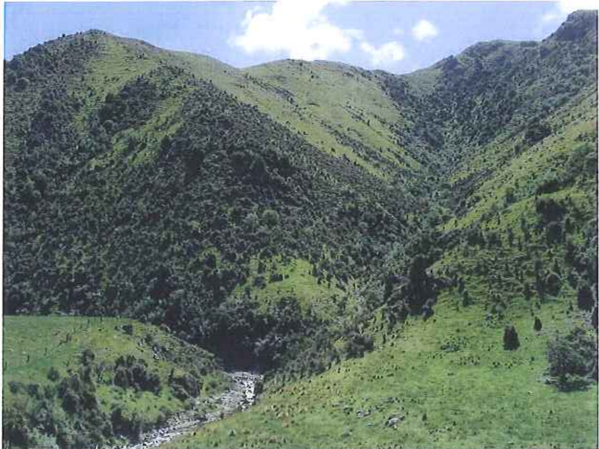
Middle valley seen from Andrews Stream; note the extensive shrublands on the face above Andrews Stream