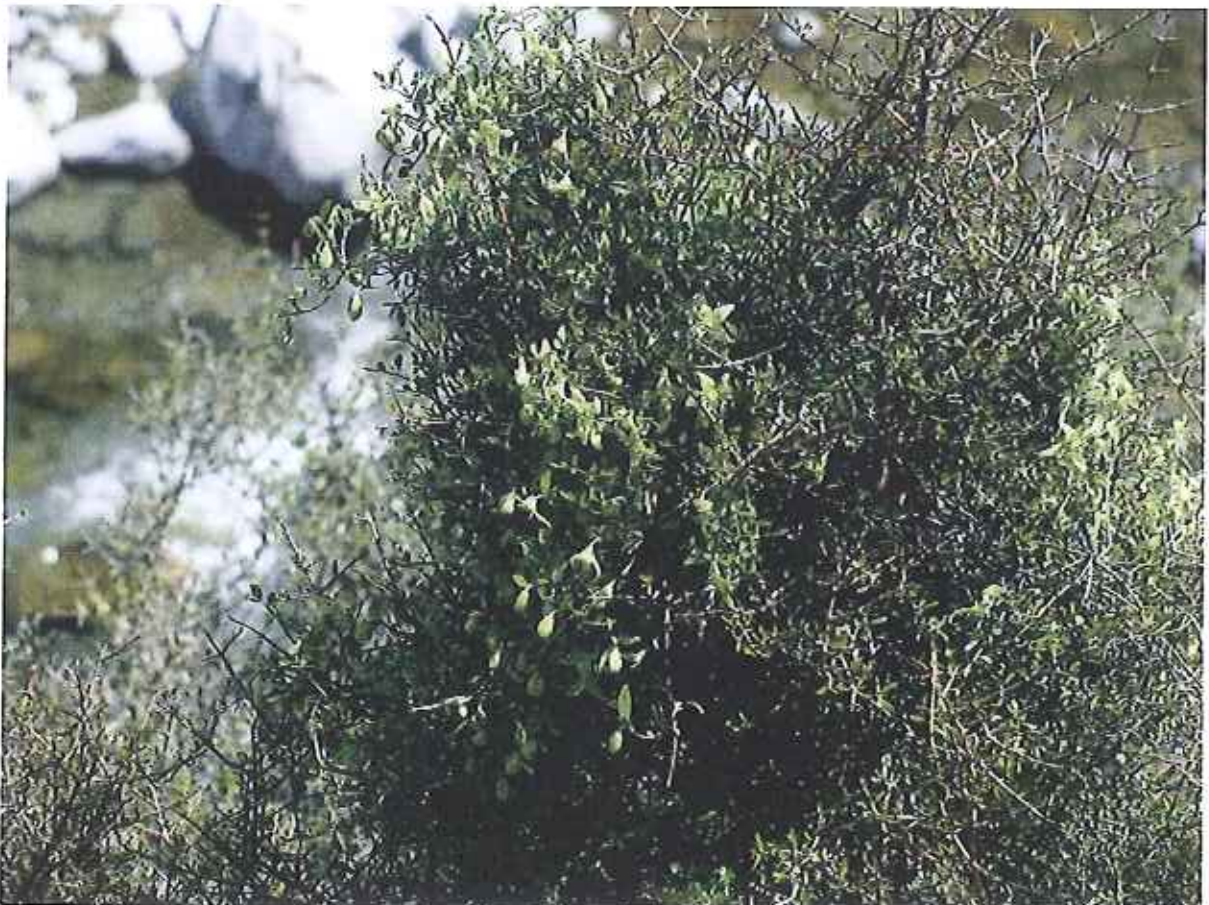
Yellow clematis Clematis marata : good number of plants in the area