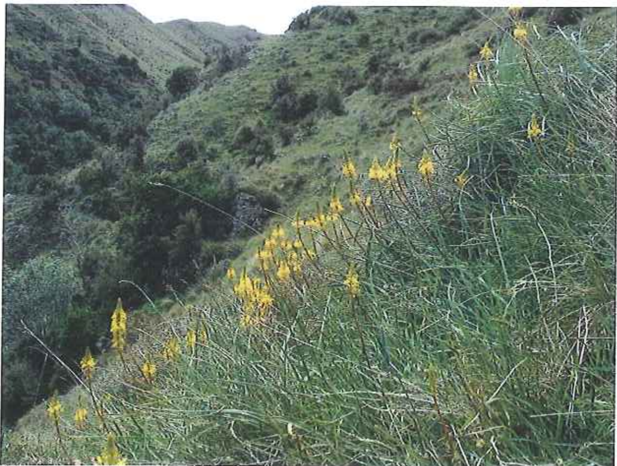
The Maori onion Bulbinella angustifolia