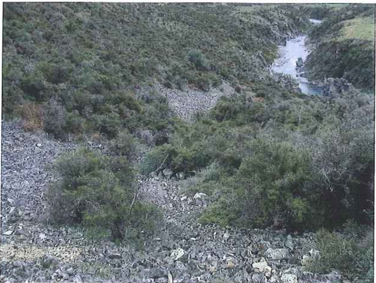
Scree area: ideal habitat for skinks and geckos