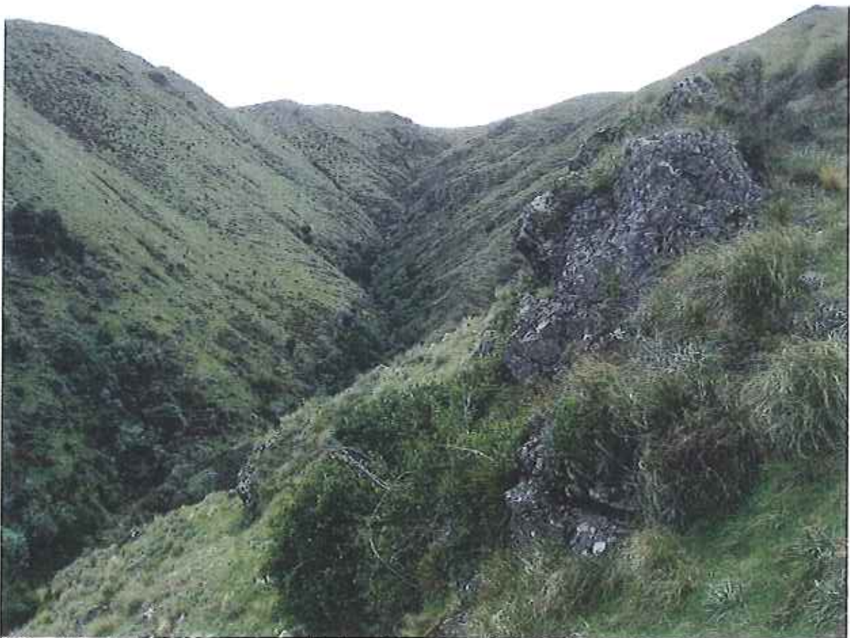
Valley to the West: rocky outcrops, shrublands and tussock areas in the higher parts