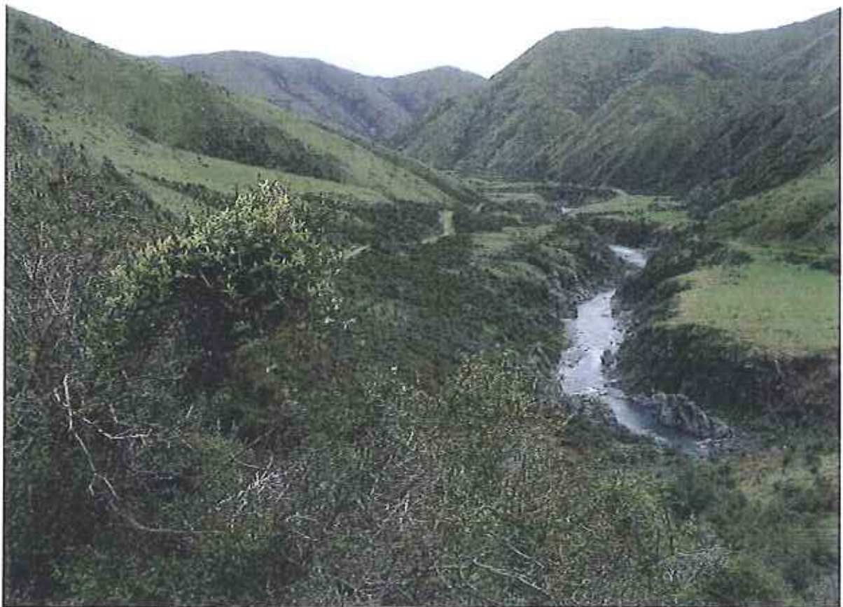
Extensive shrublands on the true right between river and track, native clematis in the foreground