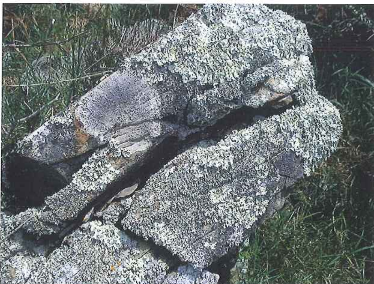
Rock with cracks: typical habitat for the Southern Alps gecko Hoplodactylus 'Southern Alps' (see scats inside the crack)