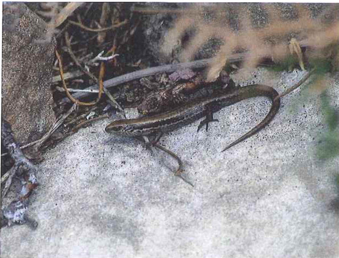
Common skink Oligosoma polychroma ; good populations observed