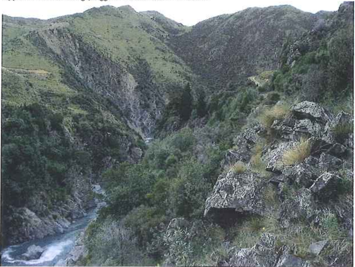
Orari Gorge with rocky outcrops and native vegetation