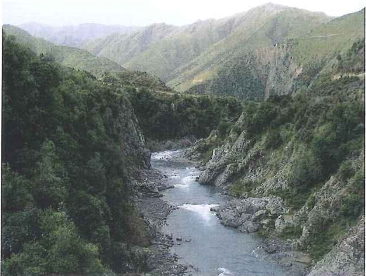
Orari Gorge, another aspect