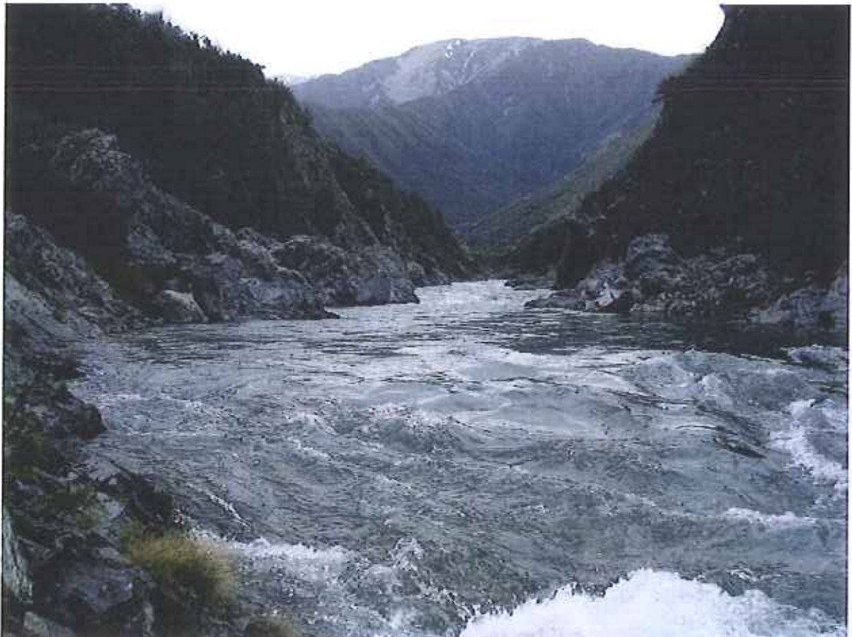
In the gorge