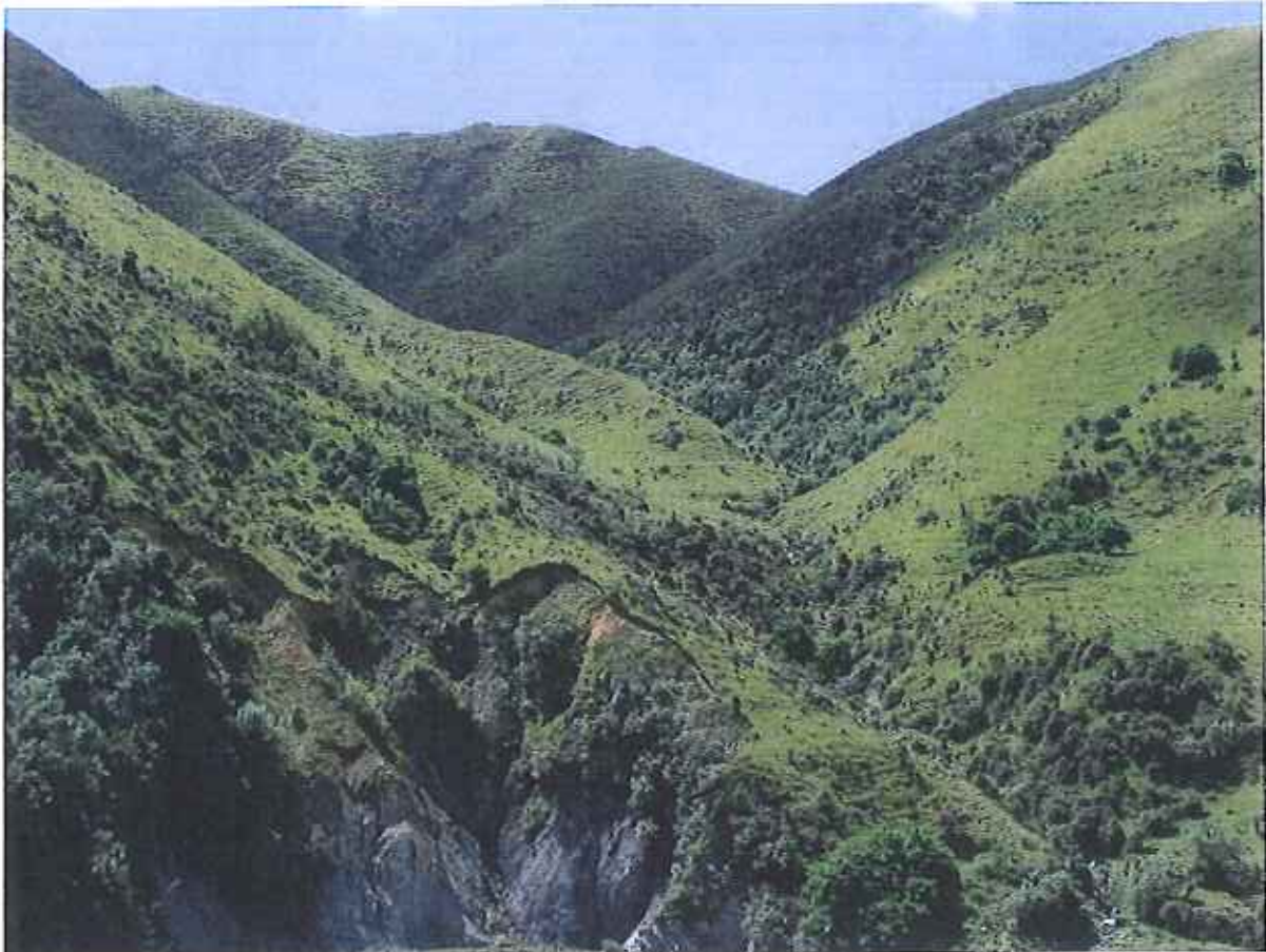
First Valley (from the East): note the shrublands and the slip