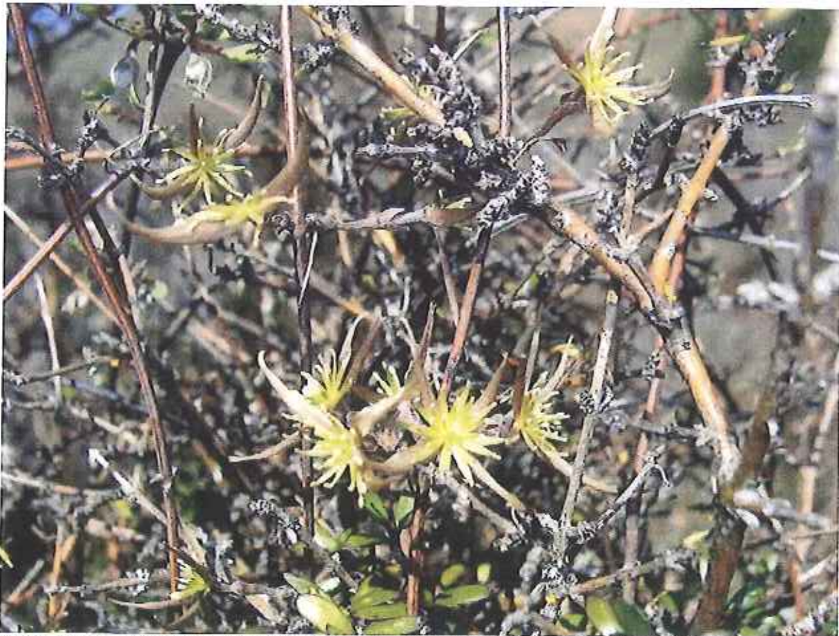
Yellow clematis Clematis quadrabracteolata : a rare species in Canterbury, not mentioned in CRR