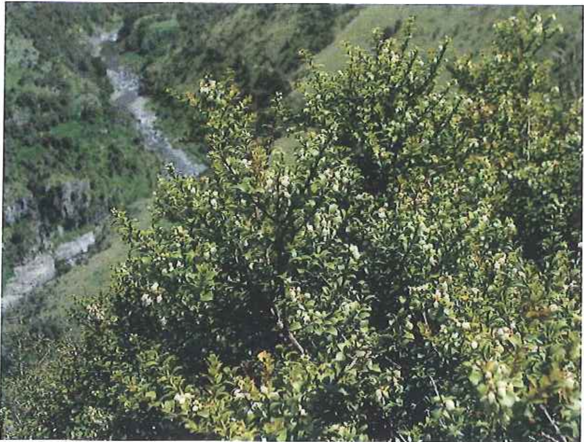
Mountain wineberry Aristotelia fruticosa