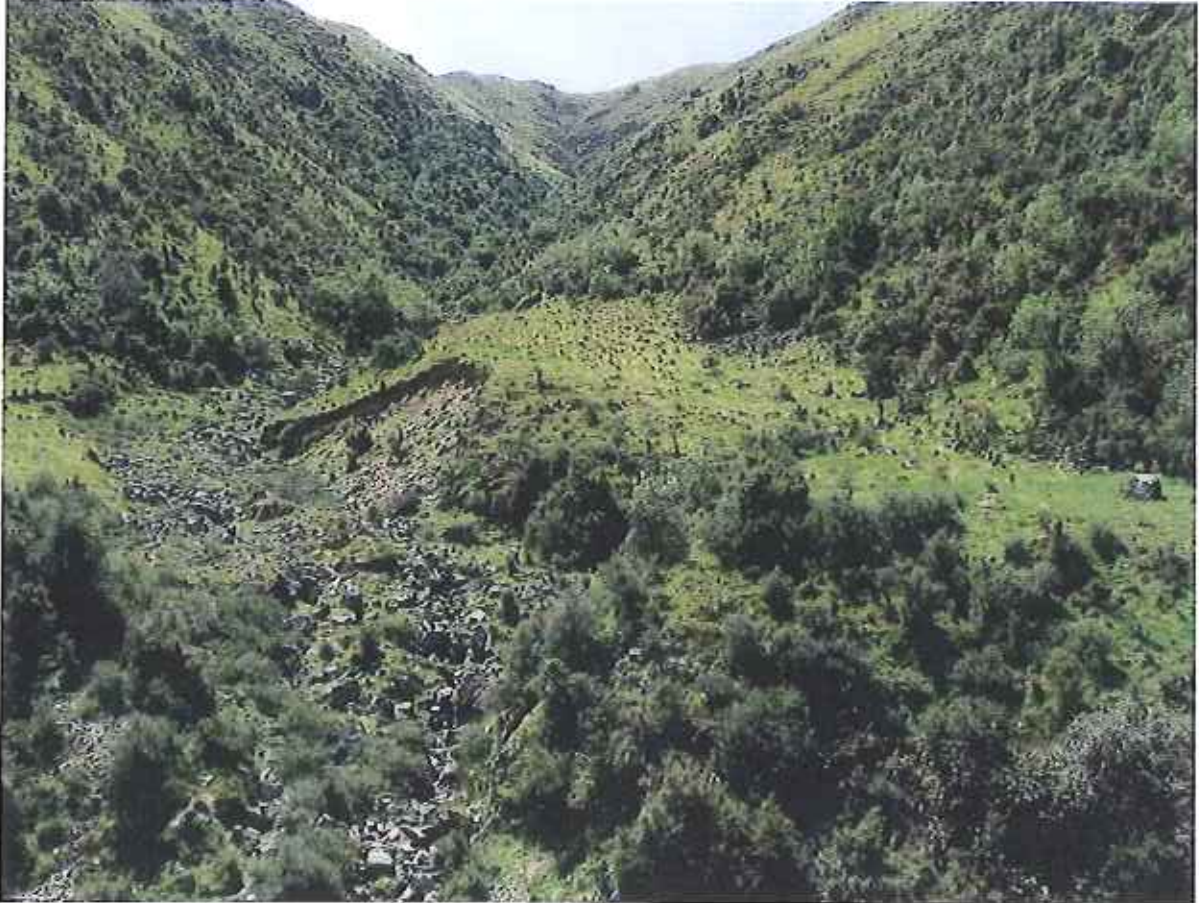
Valley to the west seen from Andrews Stream: Stream and shrublands right down to the valley floor