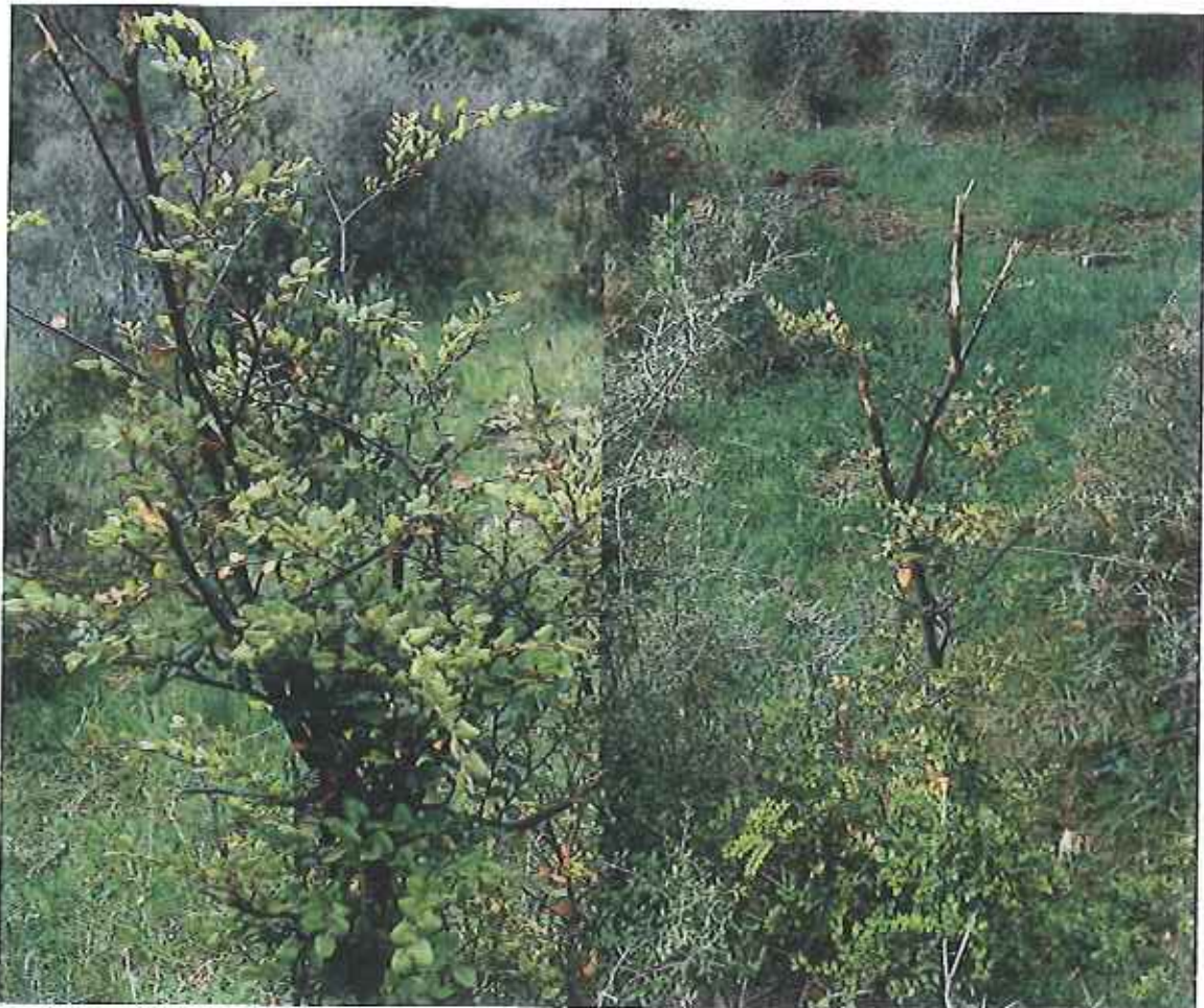
Stock damage of young mountain beech trees