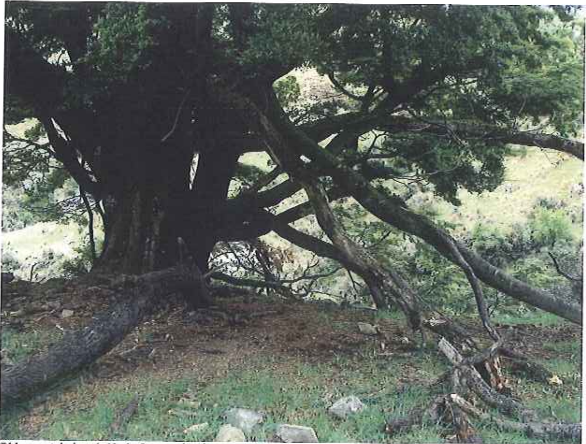
Old mountain beech Nothofagus solandri