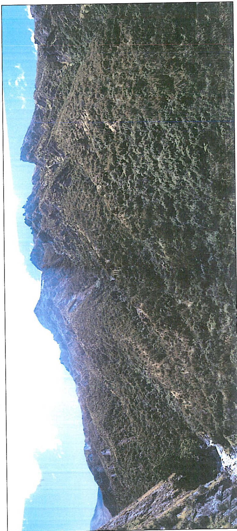
Branch Burn Headwater shrublands