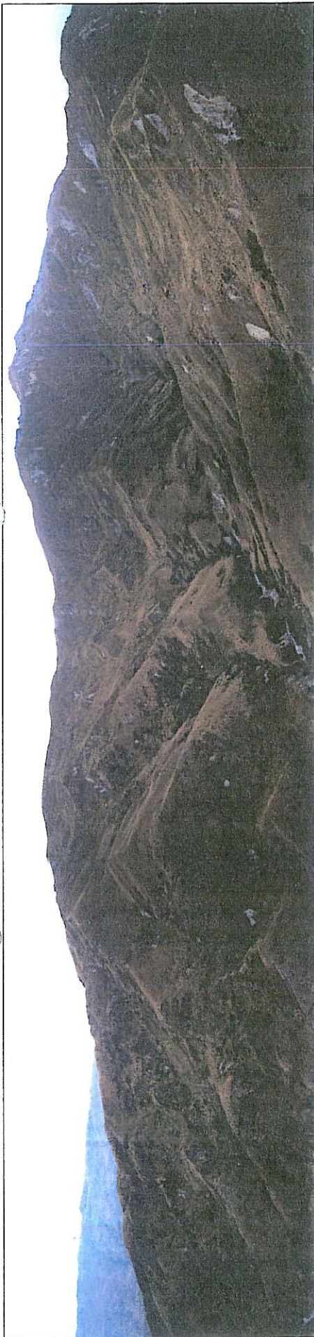
Mount Cardrona and the Macdonald Creek headwaters