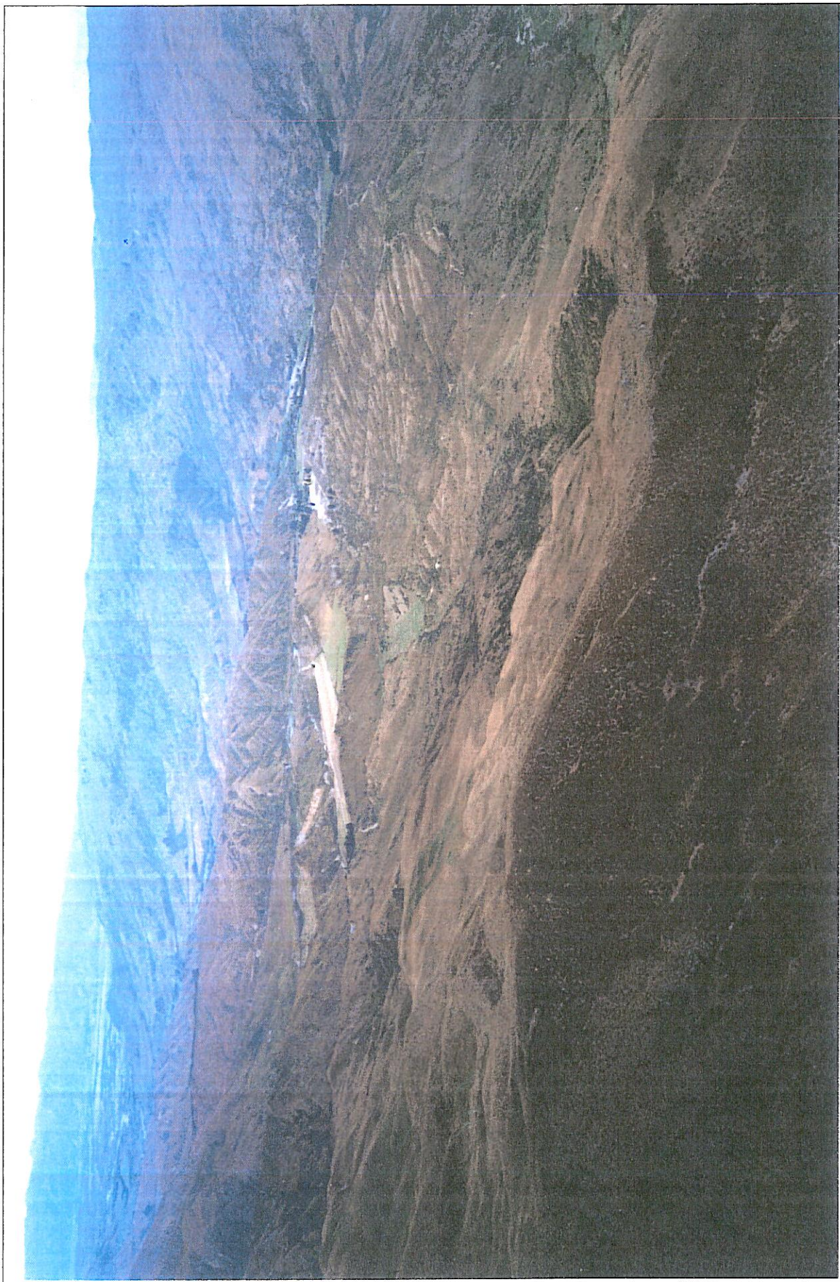
Branch Creek low country and the Cardrona Valley beyond