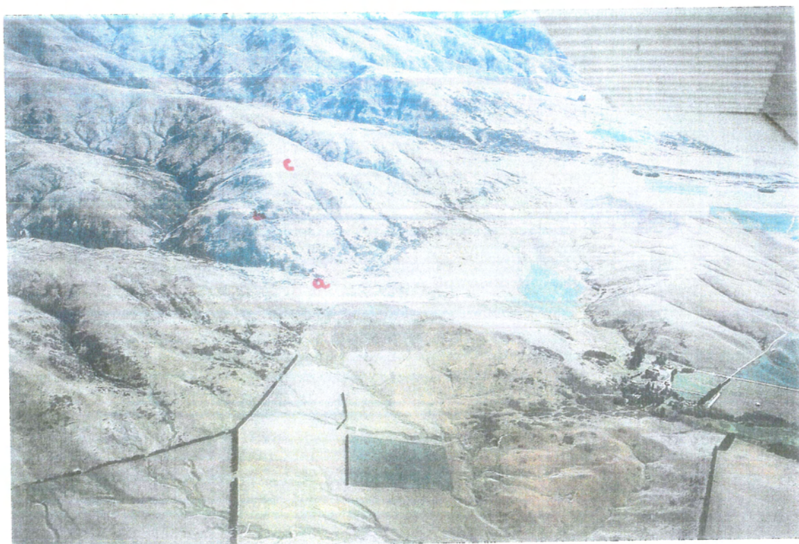
Photo # 2 Shows Lauder homestead and the cultivated right basin of Woolshed Creek above it on Lauder. To the left of which is the spur up which a shared track runs up hopefully to the Lauder Tussock Reserve. a b c