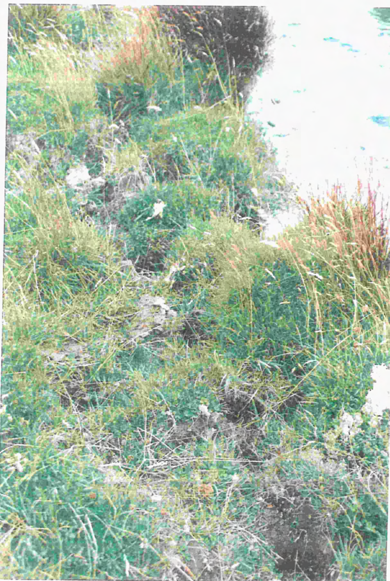
Figure 18: Stock trampling of the stream bank in the section of Gentleman Smith Stream subject to reduced flow by the diversion of the unnamed stream.