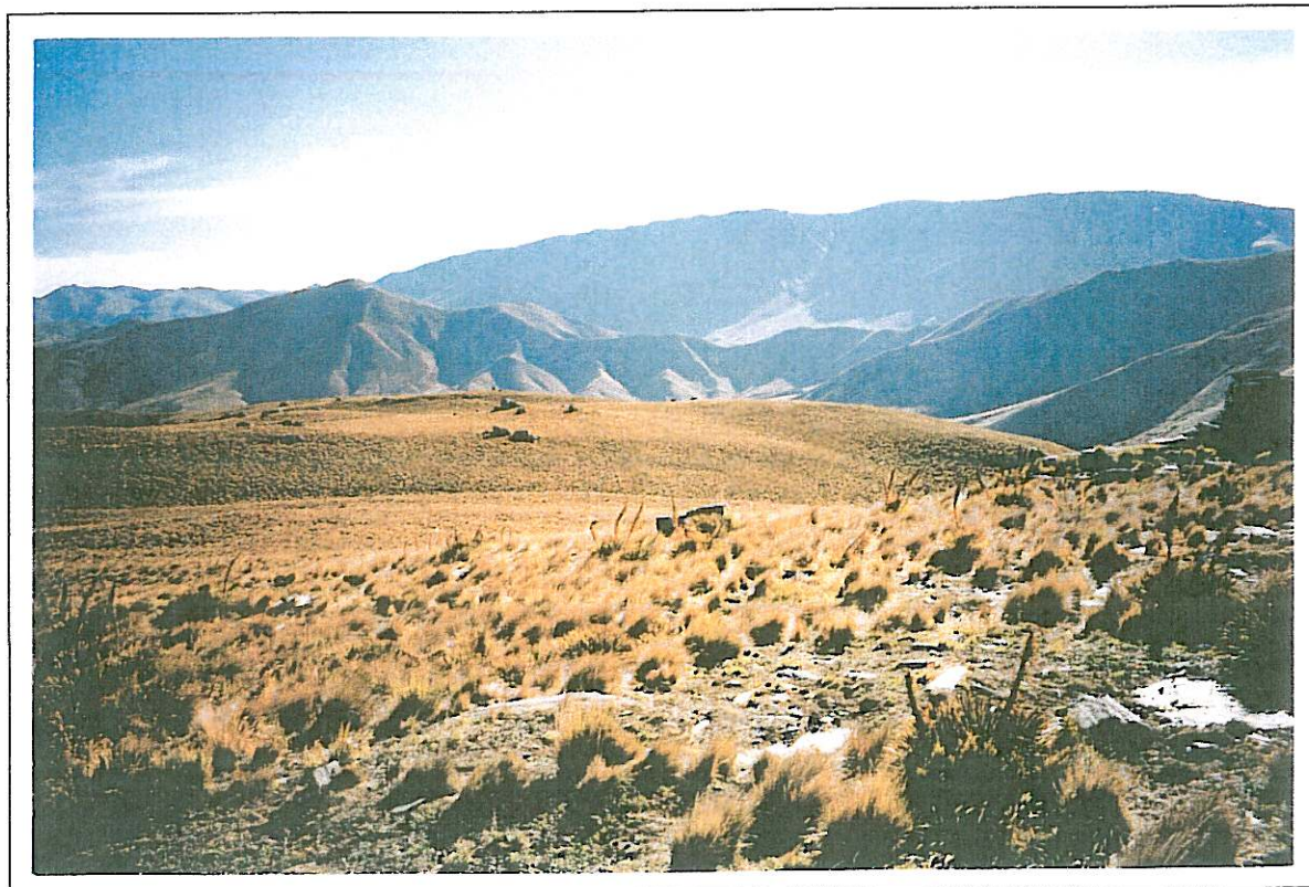
Fig. 2 Looking towards Dunstan Pass (the low saddle in the middle distance) which gives access to Dunstan Creek and St Bathans, with the St Bathans Range beyond. Public access to Dunstan Pass is emerging out of the reviews of the Lindis pastoral leases and continuous public access from Dunstan Pass to Thomsons Saddle, including crossing Cloudy Peak, would greatly enhance the recreational opportunities in the area.