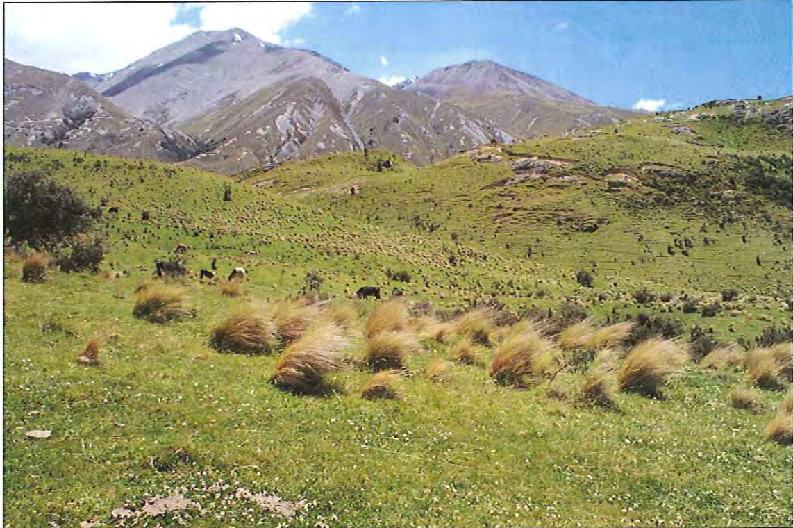
Figure 2 - South side of Mt Sunday looking back towards Mt Potts

CC1 has been intensively farmed along with over sowing and topdressing. Its natural vegetation has been heavily modified. The use of this area is critical to the maintenance of the size and quality of the cattle herd, thereby allowing the farm to be an economic unit post tenure review.