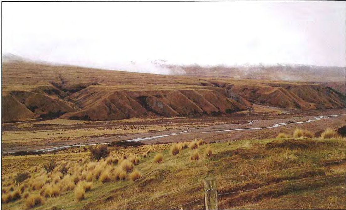
Figure 1 - Conservation area adjoining Potts River showing ease of access up spurs

No designation changes are justified here. The point is therefore not accepted.