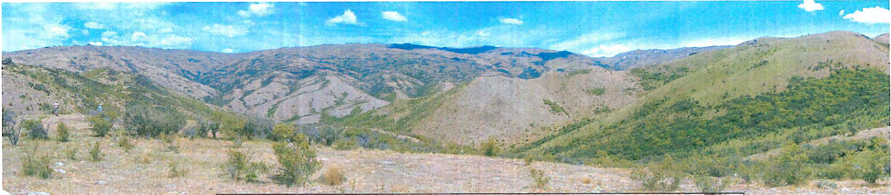
Looking across Duffers Gully to tops of Old Woman Range