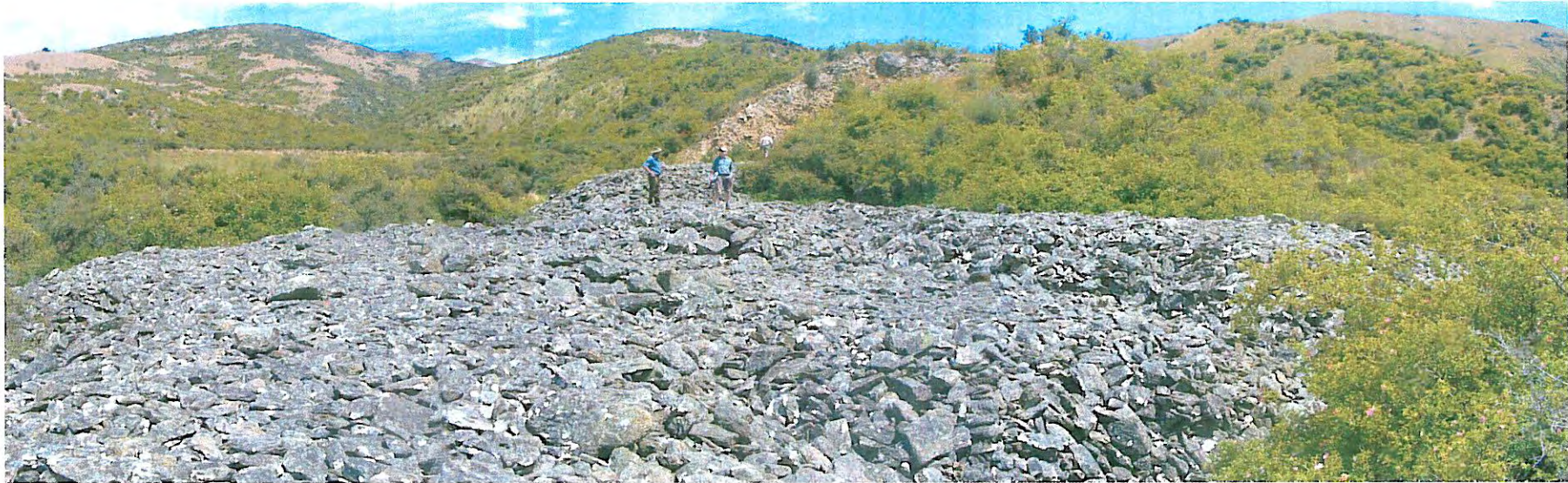
Duffers Gully Above: Stacked tailings Below: Old settlement site?