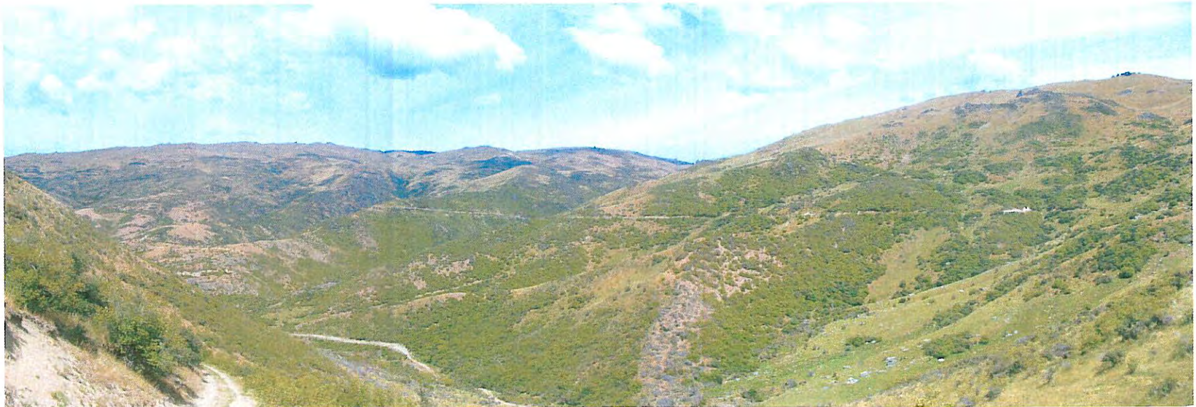
Driving into Duffers Creek from Tucker Gully