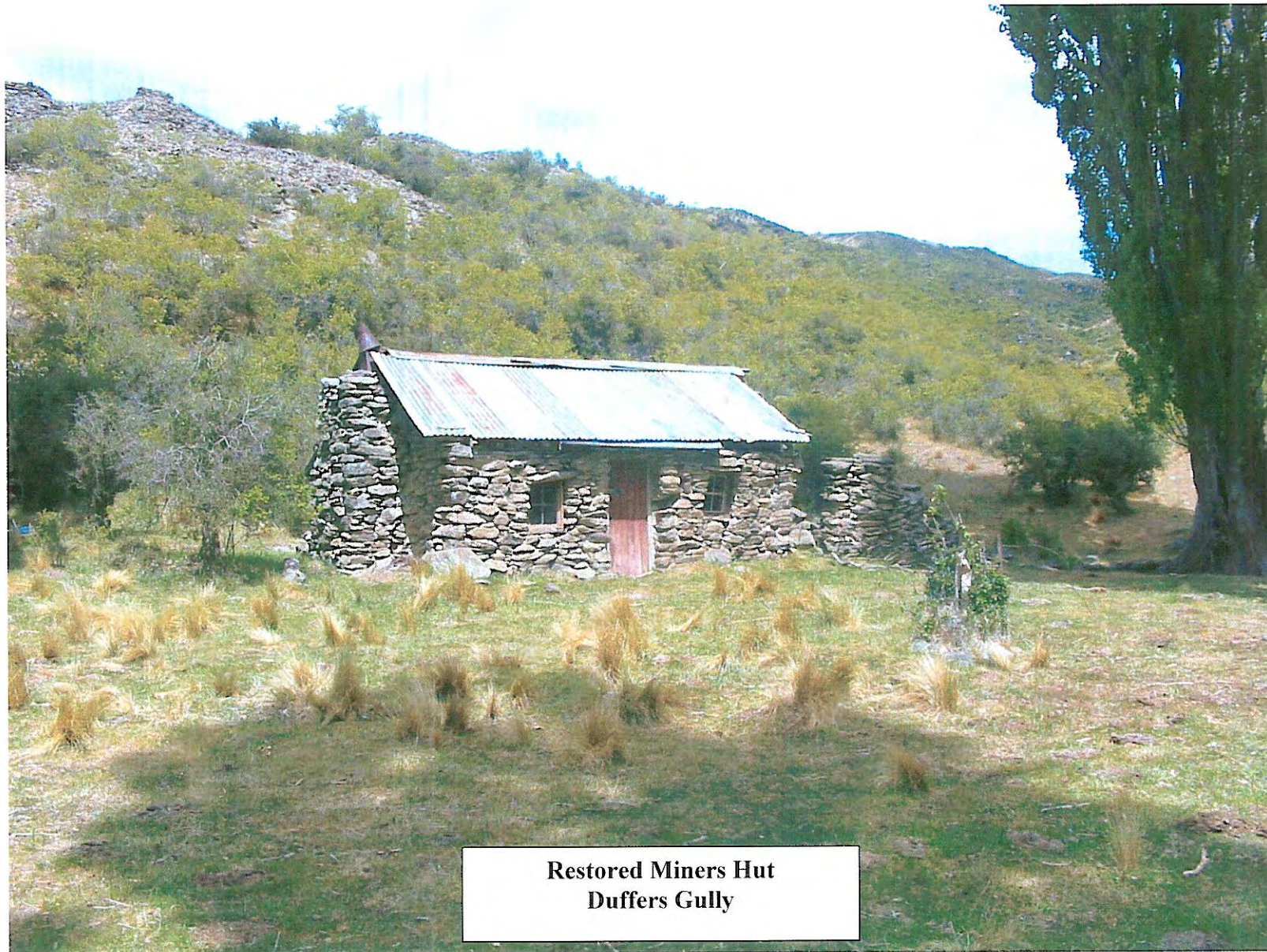
Restored Miners Hut Duffers Gully