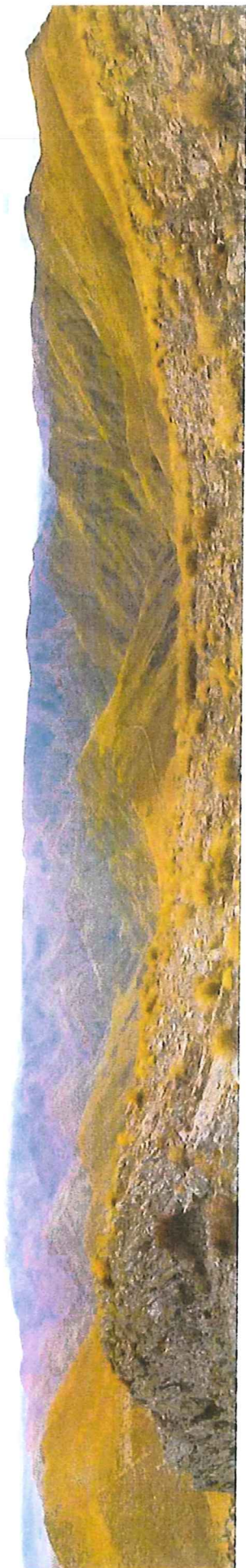
Looking Down From Conical Peak To North Branch Maerewhenua River