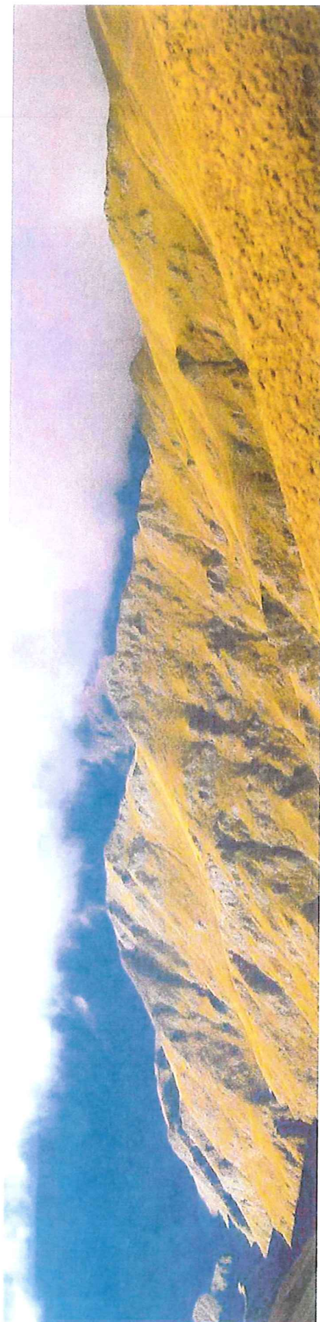
Rock Ribs on West Facing Spurs