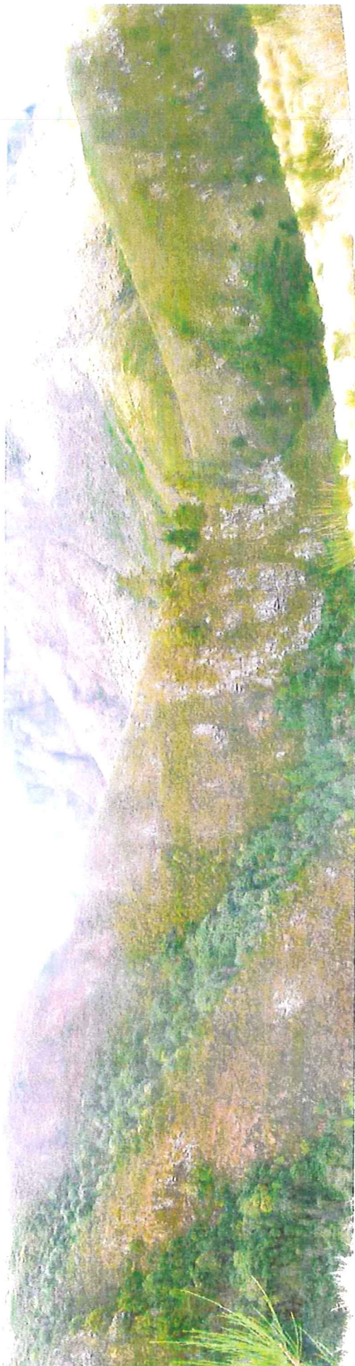
Rear of Kinross Retains Remnant Broadleaf Forest With Considerable Exotic Broom