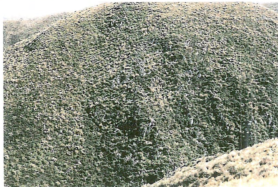
Photo 2 Area A. South facing slopes of gully immediately to north of Mt Blyth track. Note dense Chionochloa rigida grasslands, shrublands and rock outcrops. (Taken from photo point 2).