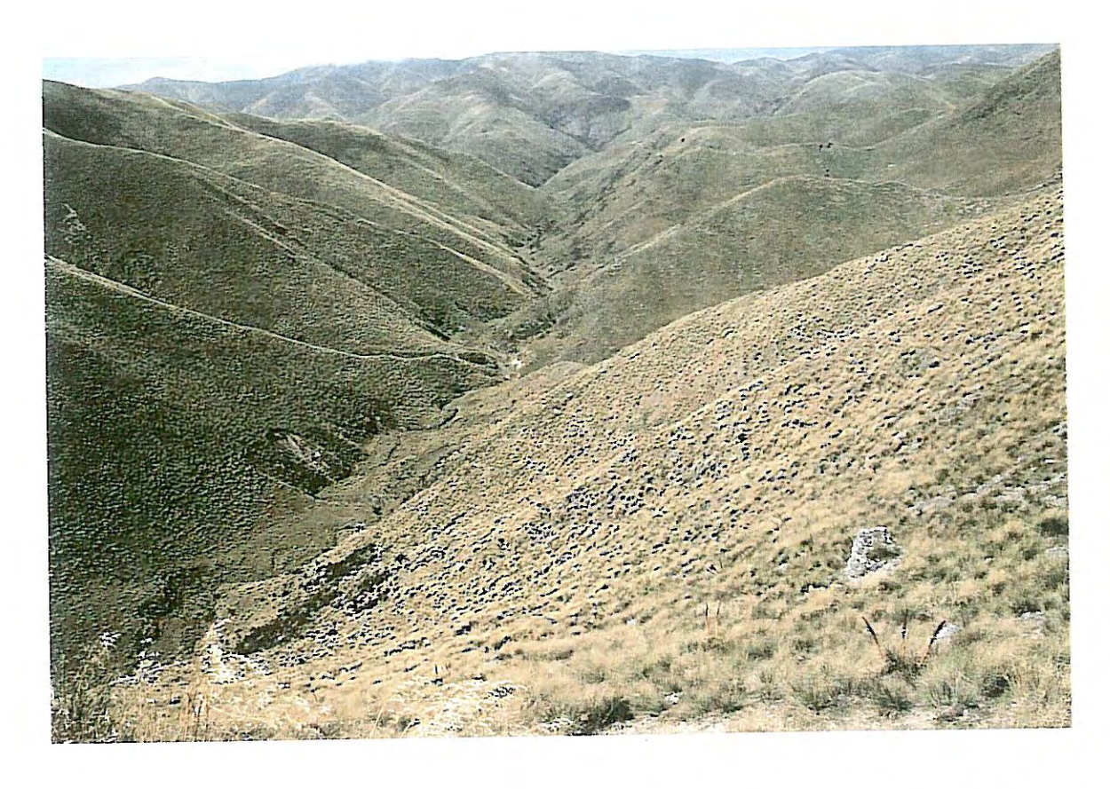
Photo 7 Area E, Kaiwarua. Snow tussock grassland in valley draining east to Otaio River. Taken from crest of Hunter Hills.