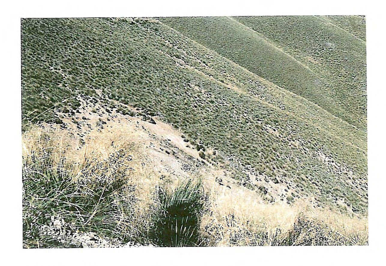
Photo 6 Increased bare ground with erosion potential as result of recent burning of Chionochloa rigida grasslands below the ridgeline track, on the northern section of Kaiwarua. Grazing and burning will not promote ecologically sustainable management.