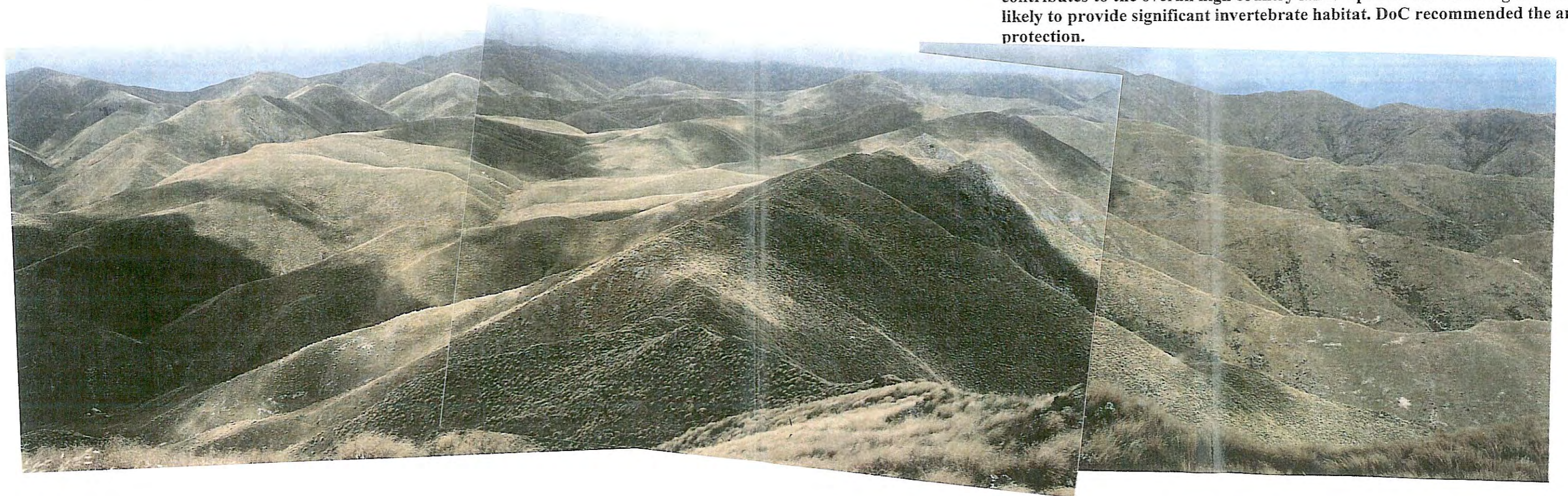
Photo 9 Area C, on Mt Cecil pastoral lease from Trig 862 looking south east. Dense snow tussock cover and rocky outcrops on steep upper slopes of east (left) and west (right) draining valleys and absence of any obvious tracking on the ridge crest gives the area a high naturalness and integrity. The area contributes to the overall high country landscape and the tussock grassland likely to provide significant invertebrate habitat. DoC recommended the area for protection.