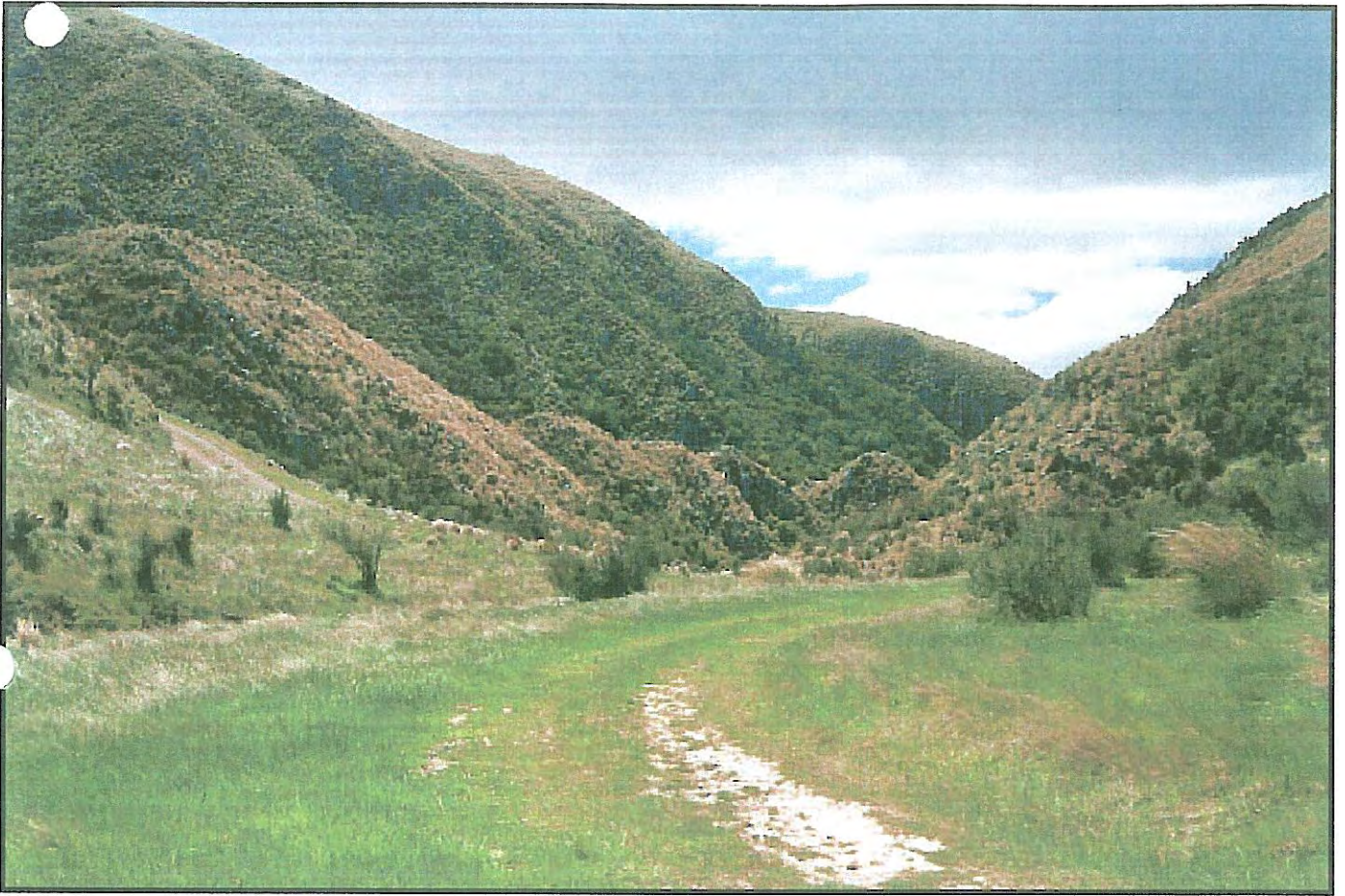
Figure 11: The area of mixed shrubland and tall tussockland at the confluence of Quinns Creek and South Branch Kakanui River. The spur in the foreground approximates the boundary between Mt Dasher and Balmoral pastoral leases.