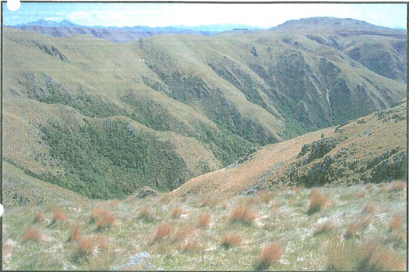
Figure 7: Looking north down Hectors Creek. These bush remnants form the section of RAP 4- Hectors which is within the lease.