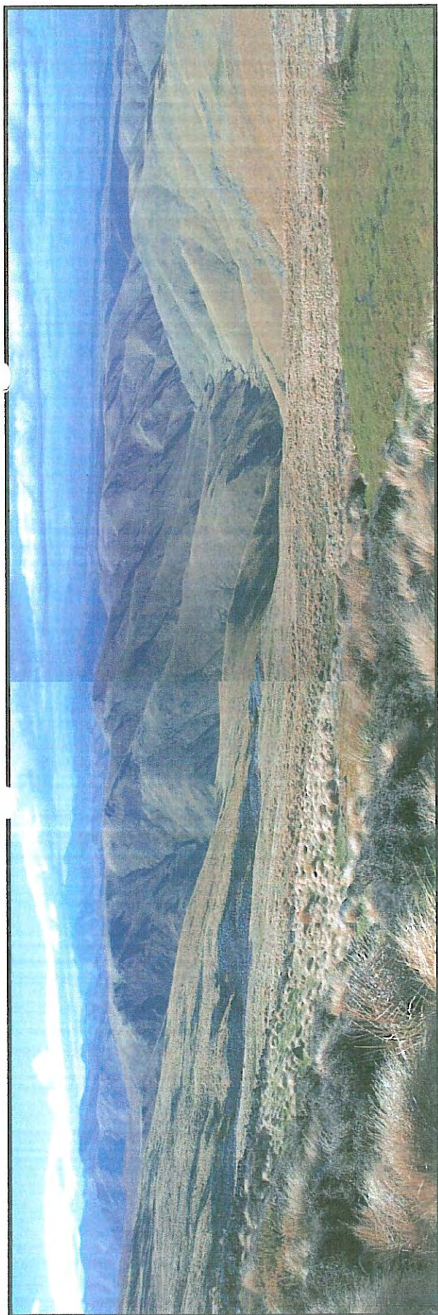
Figure 9: Looking north from below Siberia Hill. From left to right is Half Moon Spur, the headwaters of the South Branch Kakanui River and Grassy Ridge. Notable features are the remnant shrublands and flush in the foreground, the extensive intact tussocklands and the boulderstream; all contributing in part to the overall impression of an unmodified landscape.