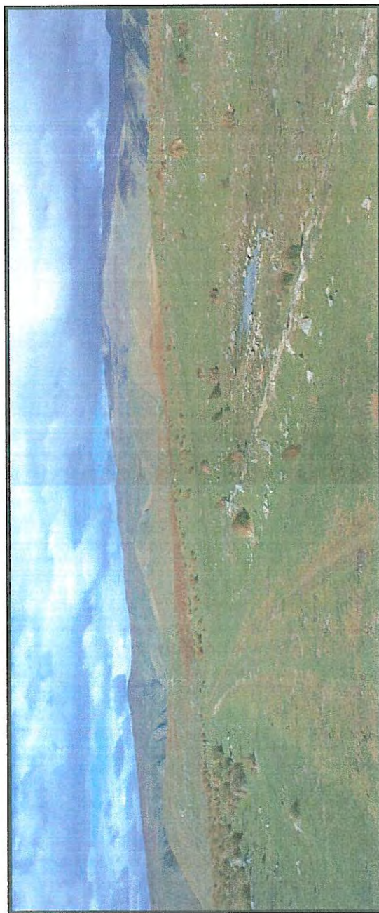
Figure 10: Looking south from below Scout Hill. From left to right are the headwaters of Hectors Creek, Hectors plateau/Siberia Hill and the upper section of Grassy Ridge.