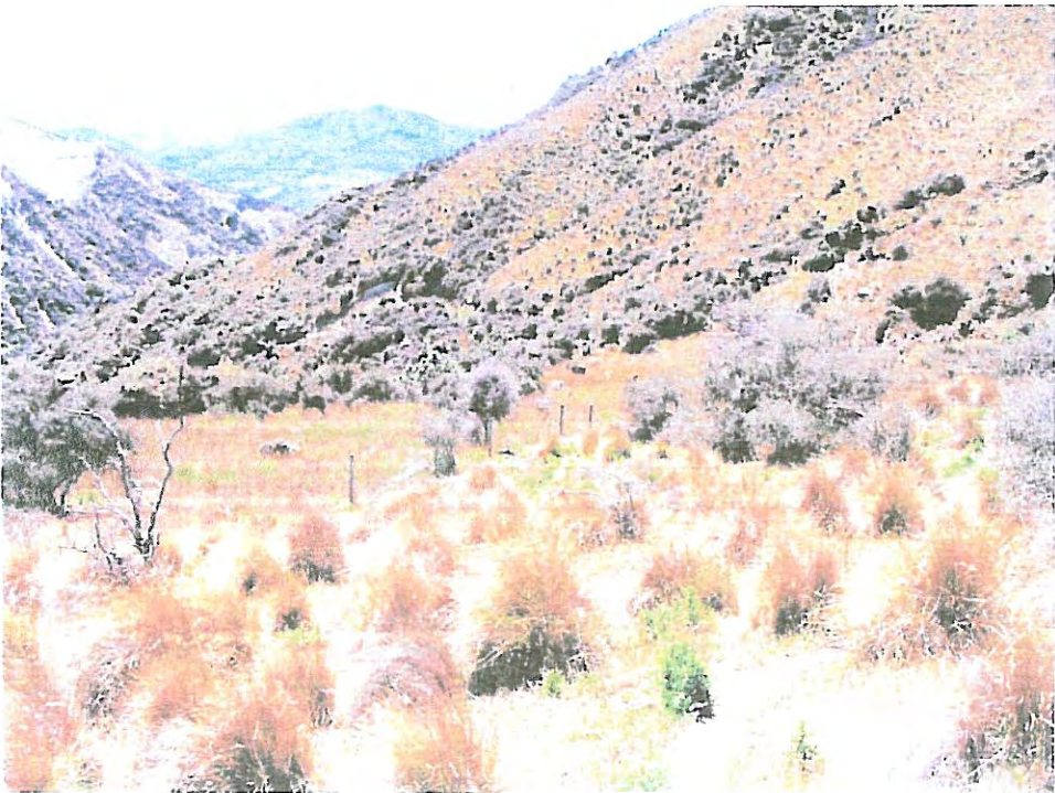
ROUTE REACHES AN OPEN SHELF AREA