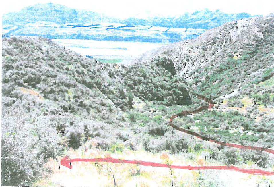
ROUTE ENTERS JACKS STREAM

THERE IS NO SECURE LEGAL ACCESS TO THE START OF THIS TRACK BECAUSE THE ROUTE RUNS THROUGH EXISTING FREEHOLD LAND