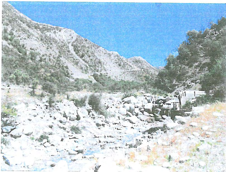
ROUTE CLIMBS OUT OF REDCLIFFE STREAM ON OLD FARM TRACK

THERE IS NO SECURE LEGAL ACCESS TO THE START OF THIS TRACK BECAUSE THE ROUTE RUNS THROUGH EXISTING FREEHOLD LAND