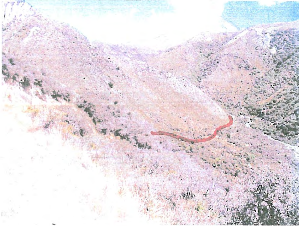
ROUTE LEAVES JACK STREAM OVER A SPUR AND DESCENDS TO UPPER REDCLIFFE STREAM