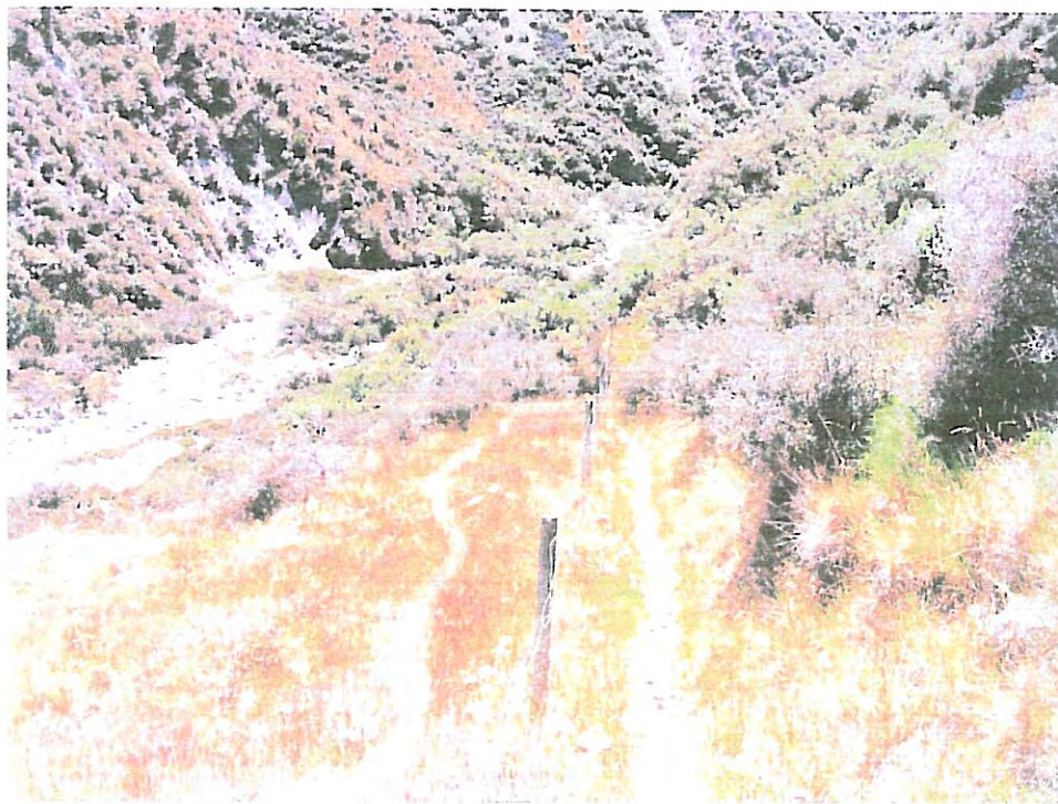
ROUTE TURNS AROUND CORNER ON FENCE LINE