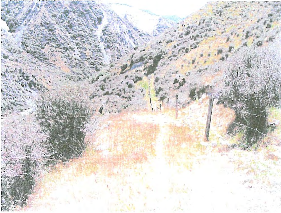
ROUTE CLIMBS UP FENCE LINE