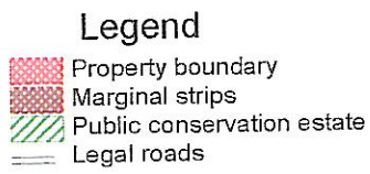
Map 4.2.1 Topo / Cadastral Shingley Creek Pastoral Lease