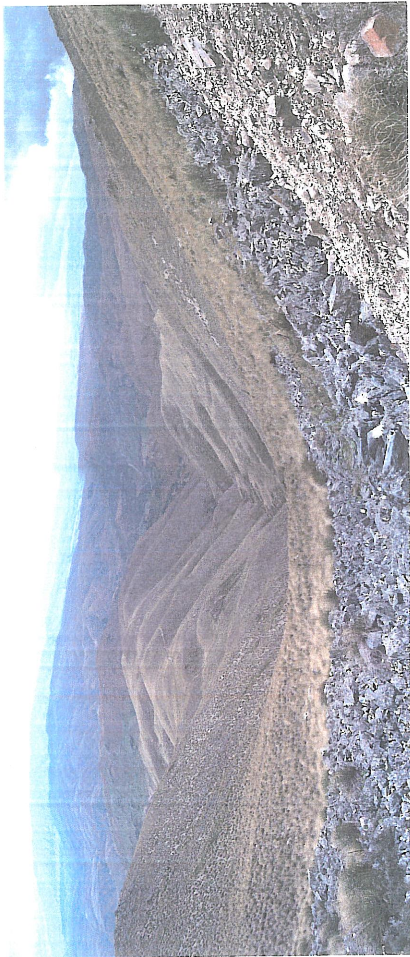
Figure 2 Looking down the largest tributary of Siberia Creek from the eastern boundary. The track on the left approximates the southern boundary.