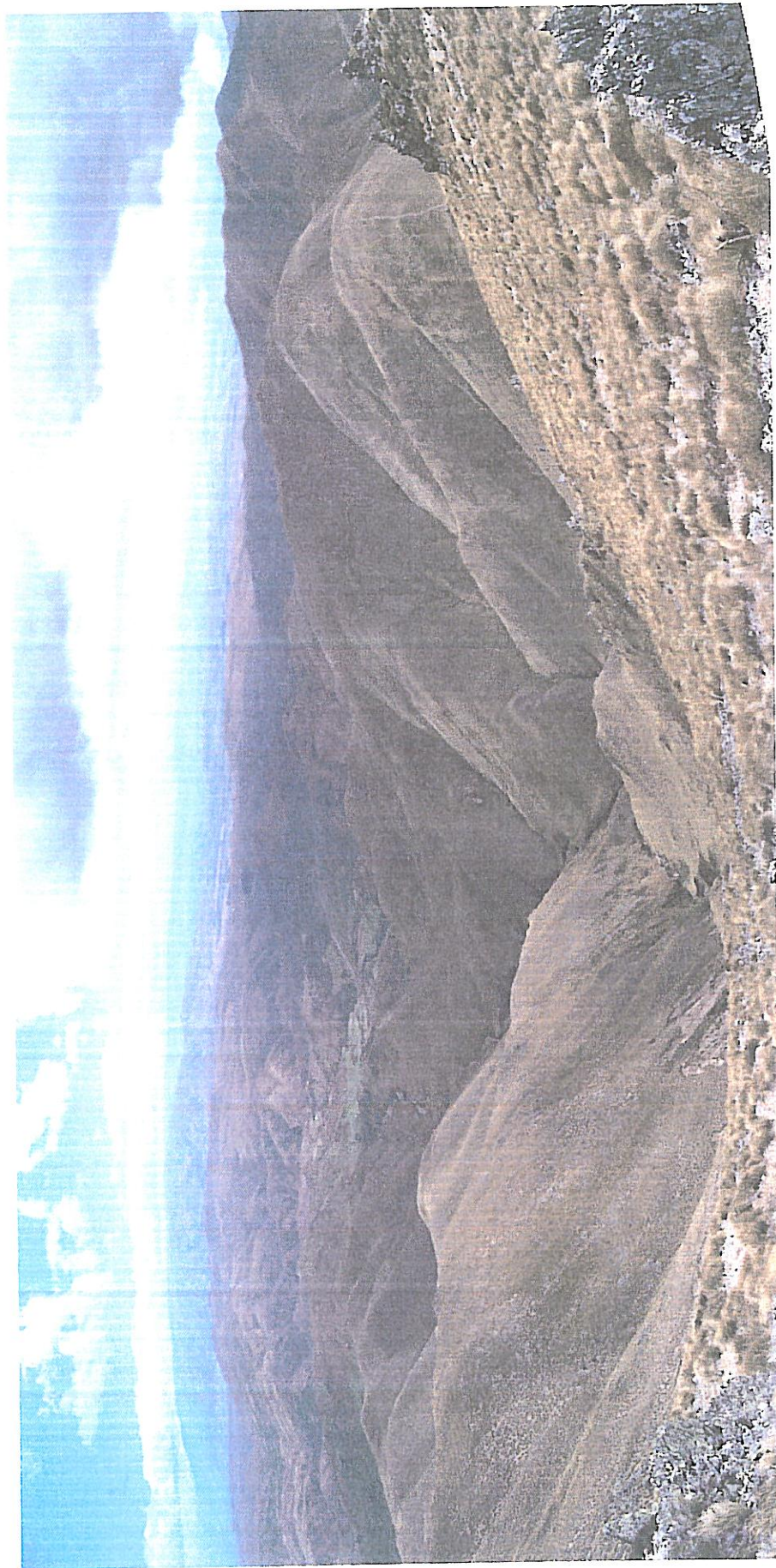
Figure 1 Looking down Siberia Creek from the eastern boundary. The track on the right approximates the NE boundary. Remnant shrublands are visible in the Siberia Creek tributary