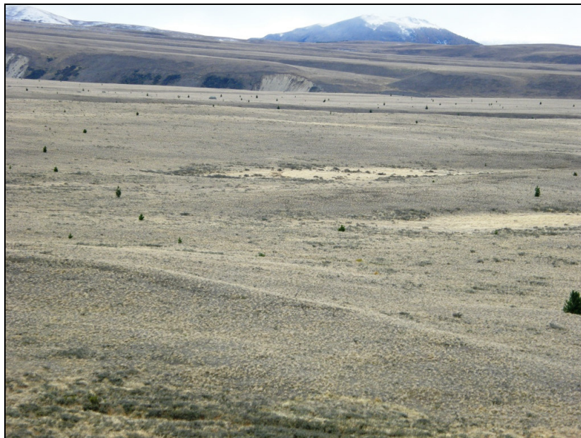
Figure 2: 'Typical' Tekapo and Pukaki soil areas on Irishmans Creek station. On these deeper soils, vegetation cover is complete and sites are capable of development for improved pastoral production. The potential for introduced trees is good, but their presence is not considered necessary to maintain 'life supporting capacity' (cf., Mackenzie / Fork soils).