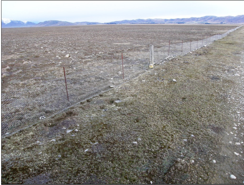
Figure 1: Typical shallow and stony Mackenzie soils in the eastern parts of Maryburn and The Wolds stations, alongside the Tekapo river. In this depleted state, pastoral productivity is very low, rabbits are abundant, and soil loss continues. Introduced trees can be grown here, and would assist in maintaining 'life supporting capacity', by promoting soil retention and improvement. However, early survival would be variable and growth slow.