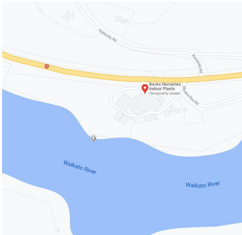
Figure 2 Map identifying Becks Nurseries water take