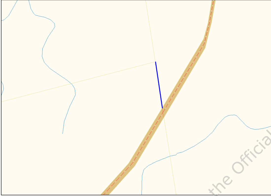
Map 1 – Benneydale 2 – Conditions 11(a)(ii) and 11(b)(i)

The required access route for public walking access between State Highway 30 (Scott Road) and the Waipapa Ecological Area is along the north-eastern boundary of Benneydale 2, as shown in blue on map 1.