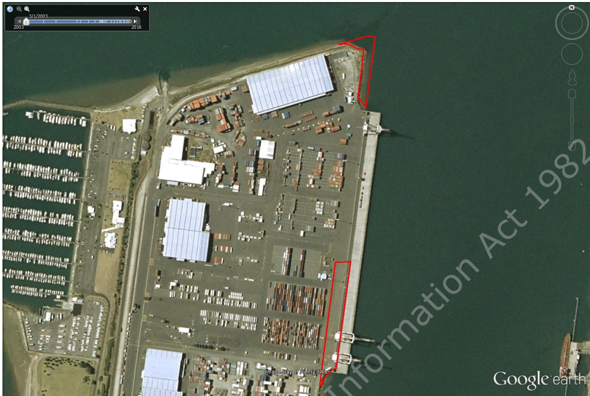
Image 2: Google Earth aerial image dated to 2003, showing the subject land prior to the reclamation of Section 1 SO 464237.