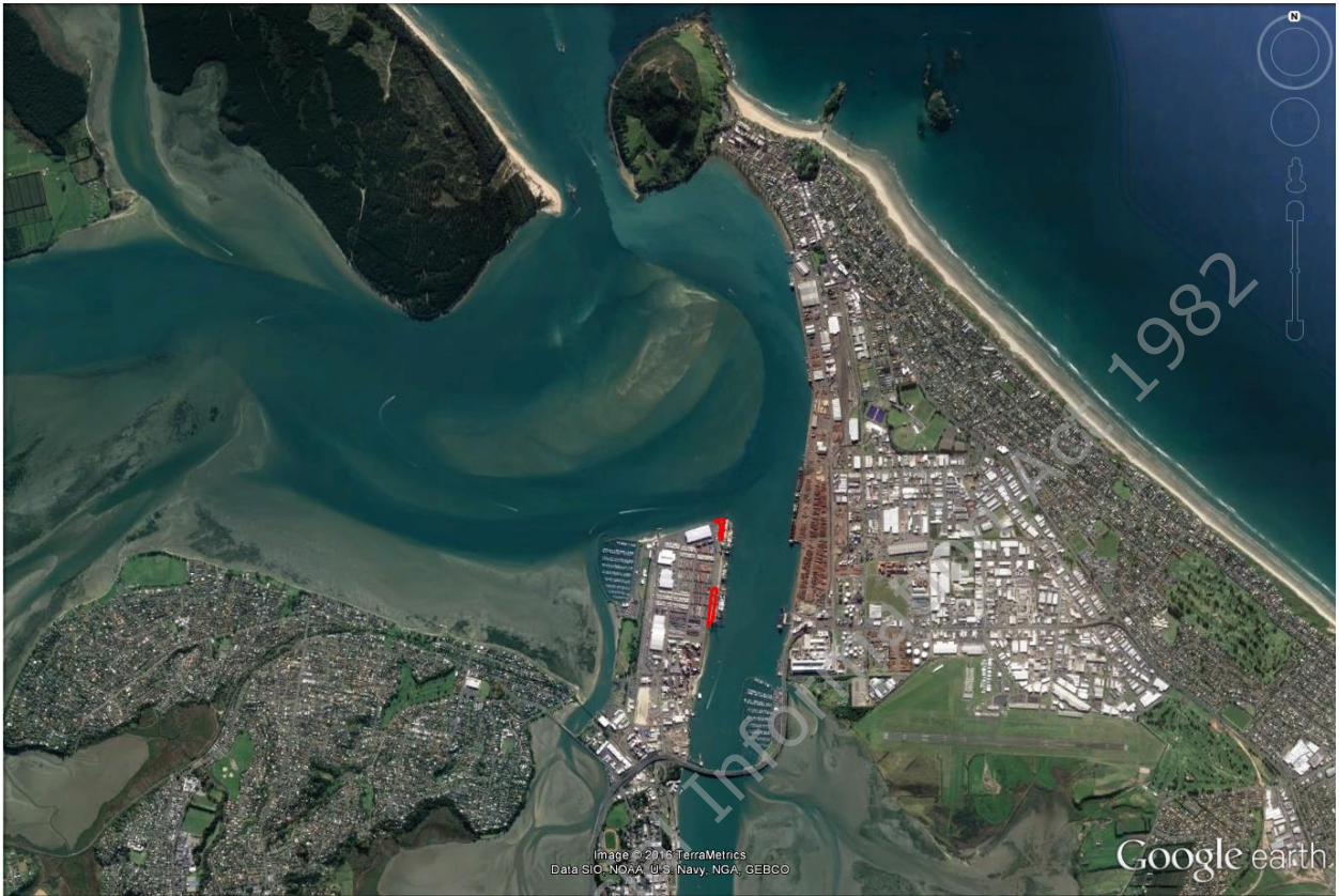
Image 6: Google Earth aerial image of the subject land (outlined in red) in its surrounding context.