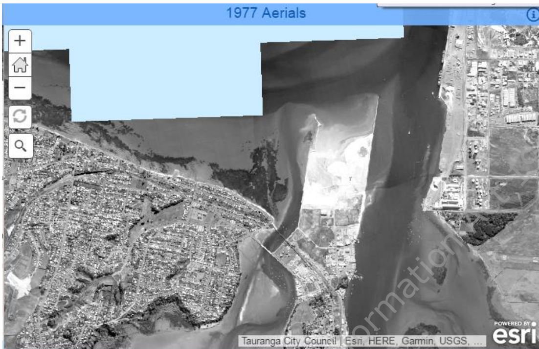
Image 4: Tauranga City Council historic aerial photo dated to 1977 showing the area where the subject land is now located as it was in the process of being reclaimed.