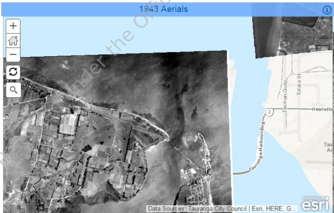
Image 3: Tauranga City Council aerial photo dated to 1943 showing that the subject land itself did not exist at this time.