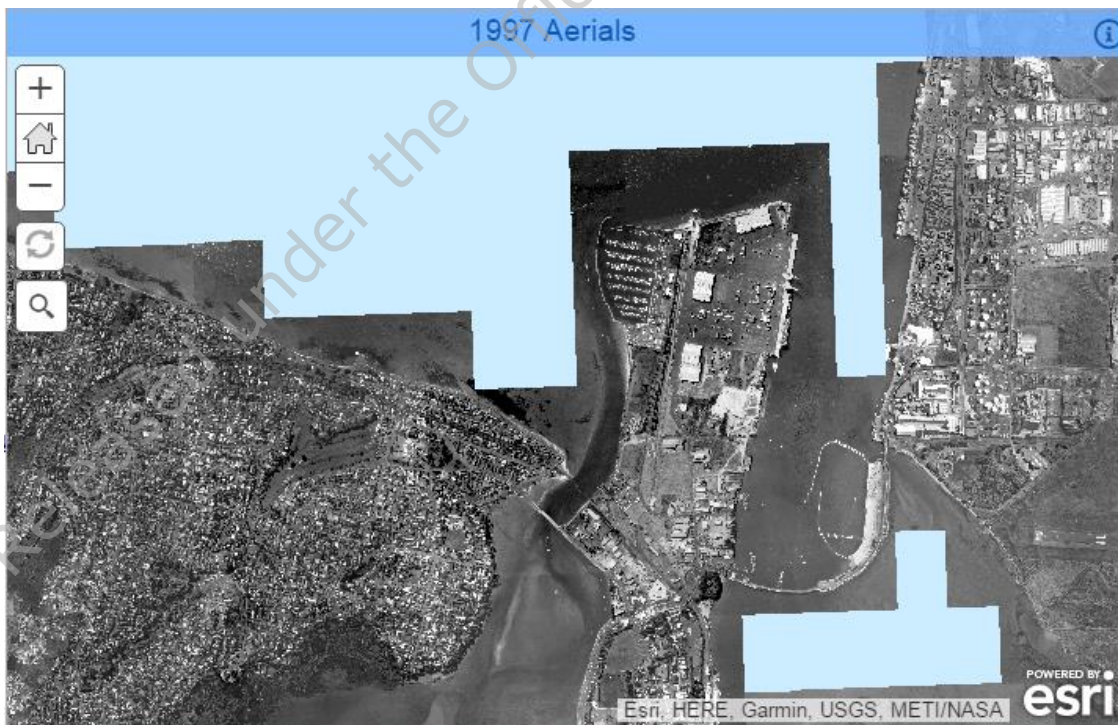
Image 5: Tauranga City Council historic aerial photo dated to 1997 showing Section 1 SO 59443 which had been built, though Section 1 SO 464237 has yet to be constructed.